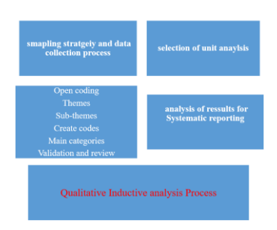
Figure 2. Procedure for conducting a qualitative inductive research content analysis

It was only once the analysis was complete that the reporting phase began, and the results were presented in a well-organized fashion. However, the researchers who conducted the study cited sources reliably, making it possible to follow the trail of evidence from the study's findings to the facts on which those findings are based. The selected quotations should present a range of perspectives from the various analysts involved in the study.