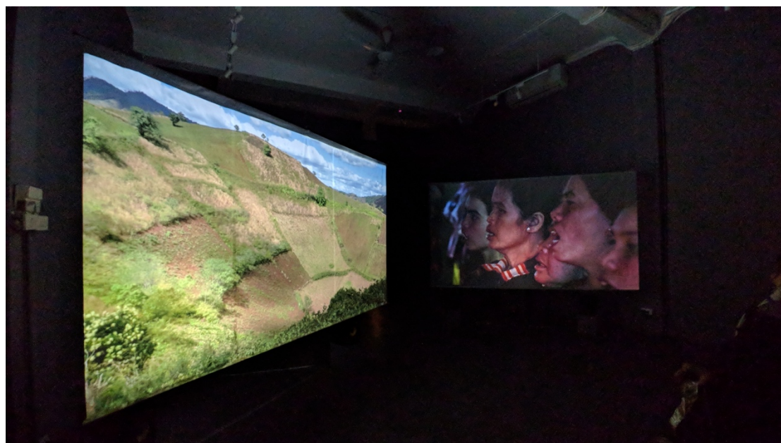
Figure 8.2: of the ‘sound and video installation’ version of How to Improve the World at Manzi Exhibition Space in Hanoi (December 2020-January 2021). The two screens display images that also appear in the film: a landscape shot of a hill, and a row of Jarai women singing in a Christian church service.