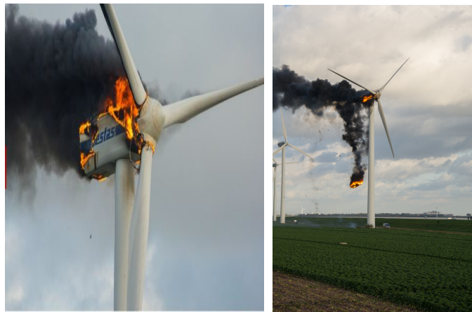
Fig.2 Fire in Wind Turbine

After successfully download all configuration and log files from the ground controller we calculated a SHA-256 hash value from all downloaded files to verify that the saved data set has not been altered later during the investigation process.