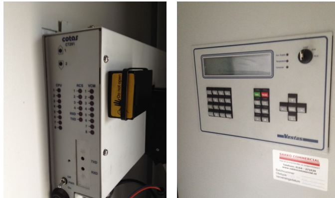
(a) Battery pack connected

server using a Tableau write-blocker and the forensic software FTK-imager. This SCADA server created reports of events, measurements and alarms. One of the events is shown below (Fig.4), this is an email from the SCADA server to the miller regarding an alarm.