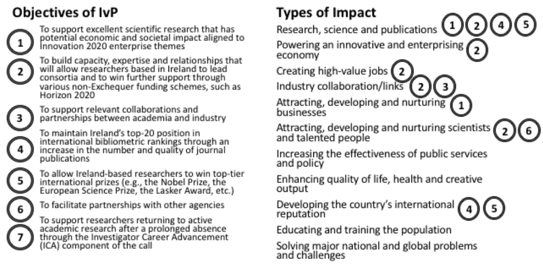
Figure 1 Alignment between IvP objectives and types of impact

them as the applicants perceived impacts that are more aligned with the objectives of the programme would be more favourable. However, further studies are needed to understand the reasons behind the lack of mentions and discussions.