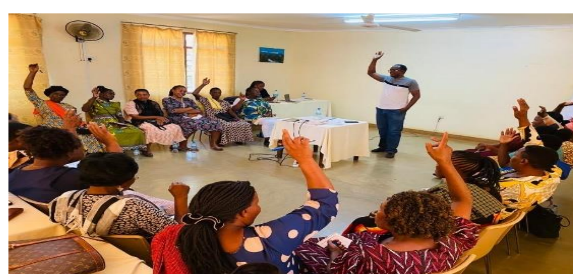
Figure 4: A Focus Group Discussion with Female Participants in the study area