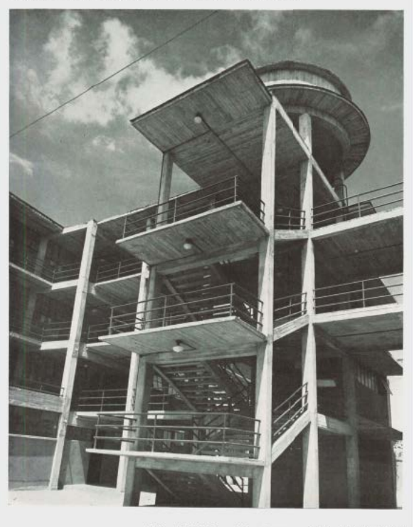
NO FRILLS, NO FUSS, NO FEATHERS

SCHOOL OF INDUSTRIAL TECHNICS, MEXICO CITY