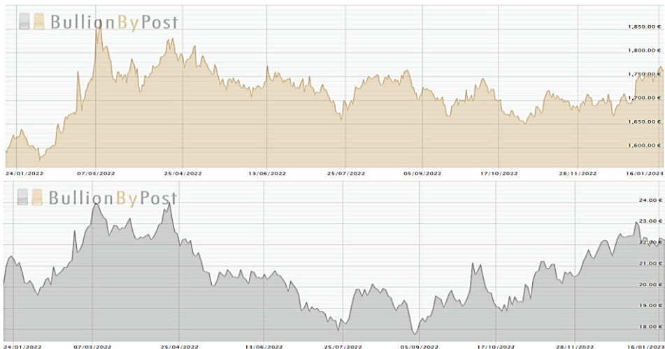
Figure 2. Gold and Silver Prices in EUR per Troy Ounce in the period from January 2022 to January 2023

basis, and the drop in prices was preceded by a drop in car sales since palladium is most often used in the car industry for the production of catalysts. Namely, the countries of the European Union voluntarily decided to stop the import of Russian palladium. Therefore, the demand for it dropped significantly, and most of the interest was redirected to the investments in gold and silver. High inflation and a slowdown in global trade also played a significant role in the price decline. The already critical palladium market once again experienced a strong blow in terms of the amount of availability since palladium stocks have been in a significant deficit for years, which was mainly caused by the tightening of the European Union's measures regarding harmful gas emissions in car engines. Manufacturers were forced to use larger quantities during production in order to meet the prescribed standards and comply with the prescribed laws. Hence, based on its properties, platinum could become a substitute for palladium in the future, which is even more likely due to the large price difference. For example, palladium has an average price of around 2,000 euros per ounce, while the average price of platinum is around 900 euros per ounce (Figure 1). In any case, it is necessary to search for substitutes in order to achieve market equilibrium and maintain the price.