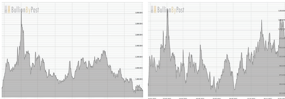
Figure 1. Palladium and Platinum Prices in EUR per Troy Ounce in the period from January 2022 to January 2023

Table 3 presents the measures of synchronization, duration and intensity for the precious metals that are the subject of our research. It can be seen that the early reaction was largely driven by precious metals which reacted faster than some other commodities. Regarding precious metals intensity, which was measured by "intensity of use", higher values were observed during the GFC and COVID-19 compared to the wartime period. This suggests a greater level of active and intensive utilization of commodities during the GFC and COVID-19, possibly driven by heightened demand or specific market dynamics. These findings emphasize the significant role played by precious metals in driving the initial response of commodities during times of crises. The duration and intensity of commodity impacts vary across different crisis periods, reflecting the distinct characteristics and dynamics inherent in each crisis event.