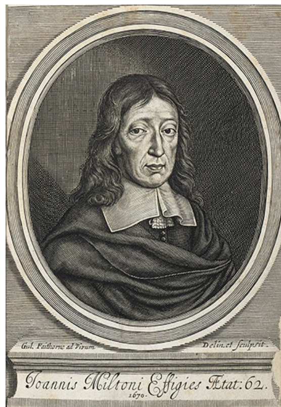
Author John Milton (1608–1684), at the age of 62. Engraving by William Faithorne.

Milton believed that while there were ideas that needed to be fought, especially heresy, this was best done in an open conversation and without prior censorship: 'Who ever knew Truth put to the worse in a free and open encounter? Her confuting is the best and surest suppressing.' He argued that contesting harmful ideas was the best and surest way to subdue them. This did not prevent