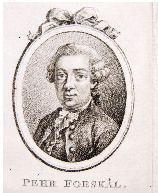
Philosopher and political writer Peter Forsskål (1732–1763). Engraving by Johan Fredrik Martin, 1780s.

pamphlet Oförgräpelige tankar, om frihet i bruk af förnuft, pennor och tryck, samt huru långt friheten derutinnan i et fritt samhälle sig sträcka bör, tillika med påföljden deraf (Harmless Thoughts, about Freedom in the Use of Reason, Pens, and the Press, and How Far such Freedom Should Extend in a Free Society, along with its Consequences). Despite having obtained permission, the printing was interrupted due to intervention from the Chancellery. Parts of the text, however, came into circulation before it was banned. As the title suggests, Nordencrantz did not advocate unlimited press freedom, and he embraced the argument that censorship contributed to maintaining the quality of books. However, he believed that the censorial office must be independent of political interests and therefore should be placed under the control of the Diet. He