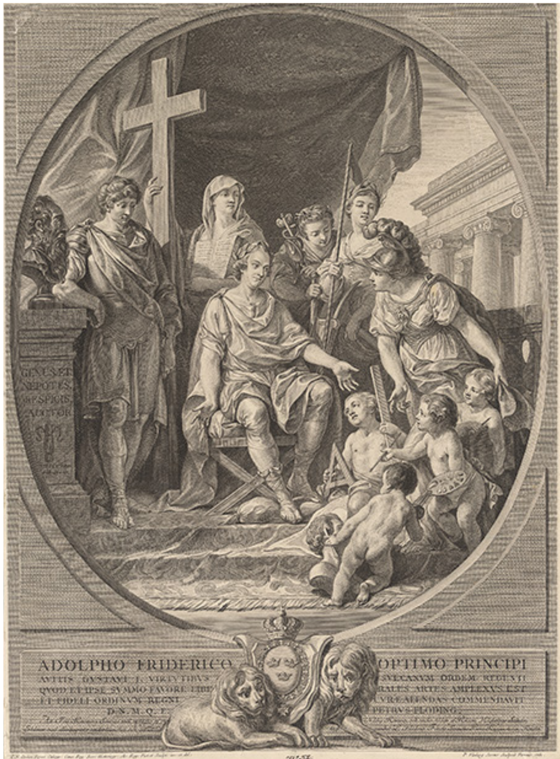
King Adolf Fredrik (1710–1771, ruler from 1751) as patron of the arts. The king's patronage is supported by the members of the four estates standing behind him. Engraving by Pehr Gustaf Floding 1761.