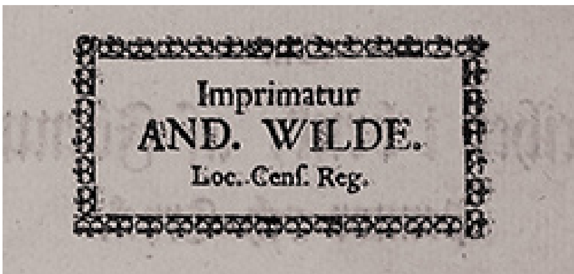
The 'imprimatur' stamp with the censor's name was compulsory in all printed matter from 1749 to 1766. This example is from a pamphlet discussing the prudence of letting the press free: Oförgräpelige gen-tankar, om frihet i bruk, af förnuft, pennor och tryck (Unprovocative Replies and Reflections on Freedom in the Use of Reason, Pens, and Printing, Stockholm: Peter Hesselberg, 1761).

Interestingly, the stamp also appears after 1766 on new editions of works that had been reviewed before censorship was abolished. The stamp may have been seen as part of the edition that should be included in an unchanged reprint. Another explanation may be that the stamp signalled that the work had been quality-checked.