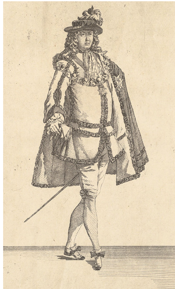
President of the Chancellery Anders Johan von Höpken (1712–1789), dressed in the attire of the Order of the Seraphim. Engraving by Jean Eric Rehn.

Montesquieu's postulate became a fundamental proposition for many reformers in the eighteenth century. His writings, along with those of other Enlightenment thinkers, were read and pondered all over the continent. In states with monolithic political systems, such as France, Russia, and Denmark, these ideas remained confined to salon discussions or were subject to the whims of the rulers, while Sweden's relatively porous and dynamic form of government provided a fertile ground for translating these new ideas into real political reforms.