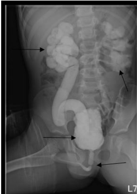
Fig. 2 Videocystometry of the presented patient at the age of 6. Note vesicoureteral refluxes (grade IV and III on the right and left side respectively), severe bladder trabeculation, and urethral obstruction – arrows (Department of Pediatric Radiology, Medical University of Lublin)

follow-up had taken place 4 months after the valve incision, the diurnal enuresis subsided, the single urine portions increased and uroflowmetry curves normalized. Serum creatinine was 0,59 mg/dL (eGFR 113 mL/min/1.73m 2 ). Unfortunately due to persistent hypertension intensification of hypotensive treatment was necessary and the daily amlodipine dose was increased to 5 mg.