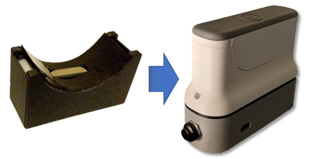
Figure 3. Evolution of the infrared spectroscopy device from the prototype to the current production-ready form [30].

Even though high sensitivity point of care testing methods provide a short TAT because we can get the results by the patients bed, they still require blood draws. A possible and very promising solution is the development of wearable devices able to estimate circulating cTn levels transdermally [28]. Developing wearable devices with similar reliability and performance to POCT hs-cTn assay is a very hard task. A recent report of the assessment of cTnI levels through skin, an infrared spectroscopy device (Figure 3) seems to be an inherently sensitive detection mode due to its ability to interact with the cardiac troponins at the fundamental level and doesn't require any blood sampling or blood processing [29].