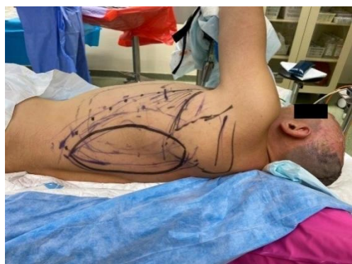
Figure 2 Determining the LD flap collection site

A 29-year-old male patient suffered a 3rd / 4th-degree electric burn affecting both legs and head. The burn, which occurred on December 24, 2019, was caused by high-voltage electricity in a transformer station. After the accident, the man was immediately transported to the anesthesiology and intensive care unit. As soon as the patient's condition stabilized, his treatment began at the plastic and burn surgery department and at another burn treatment center. These two separate medical facilities situated almost 600 km from each other cooperated throughout the patient's treatment. During the performed surgical operation, the left lower limb was amputated at the shin level as well as the right forefoot. CT of the head showed slight hypodense areas in the top parts of the frontal lobes, especially on the right side. A necrectomy was performed. During the operation, surgeons found complete necrosis of the parietal and frontal bones. In the central area above the sagittal sinus, a pale dura mater was visualized. Fragments of the cranial vault were removed, revealing the dura mater, and skin grafts of intermediate thickness were placed on the tissue defects.