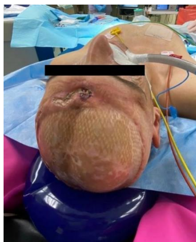
Figure 1 Patient prepared for plastic surgery

A 29-year-old male patient suffered a 3rd / 4th-degree electric burn affecting both legs and head. The burn, which occurred on December 24, 2019, was caused by high-voltage electricity in a transformer station. After the accident, the man was immediately transported to the anesthesiology and intensive care unit. As soon as the patient's condition stabilized, his treatment began at the plastic and burn surgery department and at another burn treatment center. These two separate medical facilities situated almost 600 km from each other cooperated throughout the patient's treatment. During the performed surgical operation, the left lower limb was amputated at the shin level as well as the right forefoot. CT of the head showed slight hypodense areas in the top parts of the frontal lobes, especially on the right side. A necrectomy was performed. During the operation, surgeons found complete necrosis of the parietal and frontal bones. In the central area above the sagittal sinus, a pale dura mater was visualized. Fragments of the cranial vault were removed, revealing the dura mater, and skin grafts of intermediate thickness were placed on the tissue defects.