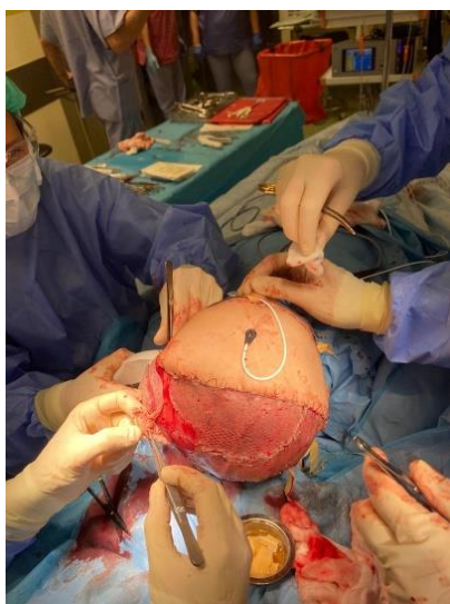
Figure 5 Placement of free grafts of skin

A vascular pedicle was found in the area of the upper edge of the muscle and dissected up to the point of the subscapular artery exit. The vessels were approximately 2 mm in diameter. Then the muscle was cut, forming a flap measuring 20x20 cm, the thickness of the muscle was about 2-3 cm. After the flap was completely dissected, its blood supply was assessed as satisfactory. Capillary recurrence was about 1.5 seconds. The flap was cut from the stalk after the dishes were clipped. Using the operating microscope, preparation of the lobe stalk vessels was performed. Then, a micro-anastomosis of the stumps of the temporal vessels and the stalk of the lobe end-to-end was performed.