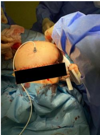
Figure 6 Final result