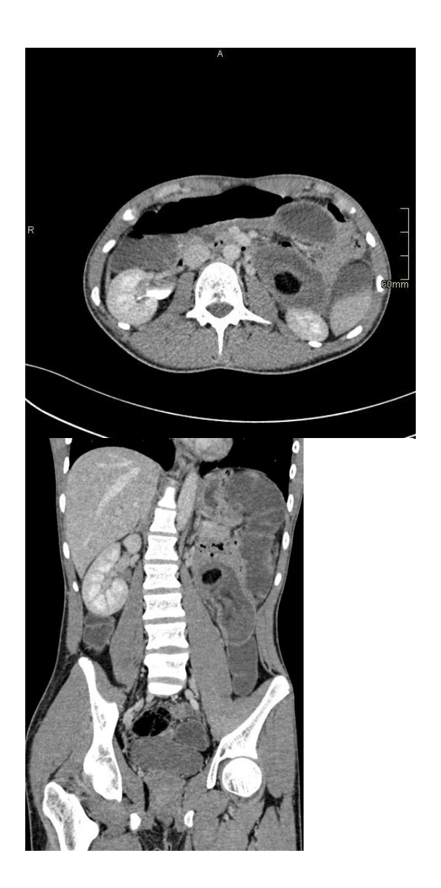
(Fig.3.) CT- small bowel intussusception with a fat-containing tumor as a lead point in a 16-year-old boy.