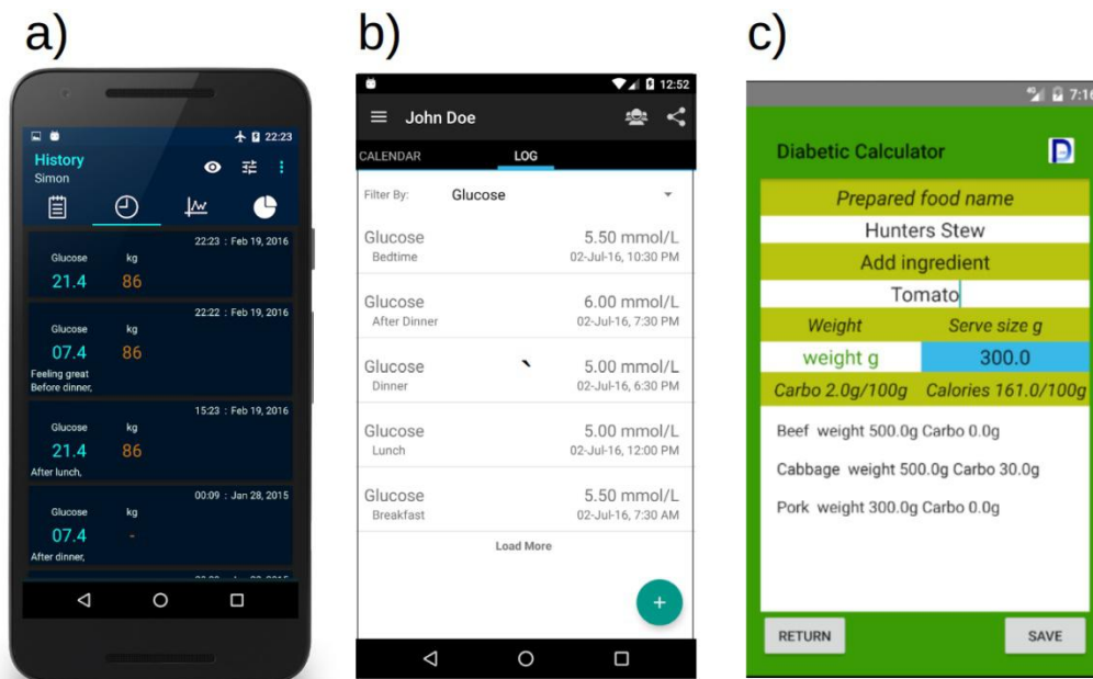
Fig. 1. Selected screenshots of the applications under discussion: a) Cukrzyca [6], b) Diabetes Journal [8], c) Diabetic Calculator [11]

There are also simple educational mobile programs for smartphones that meet the expectation 12 i.e. knowledge base. The examples here can be: Diabetes : How to Control Diabetes, Diabetes Diet [12] by the company Vdicts and Diabetes and Symptoms [13] by Appz Inventors. Browsing this group of applications, it can be notice that the expectation no 7 is covered by plenty of small applications. The following can be distinguished: Polish program Indeks Glikemiczny [14] by Mobiem company and Diabetic Diet Recipes: Control Diabetes & Sugar by Edutainment Ventures from USA [15].