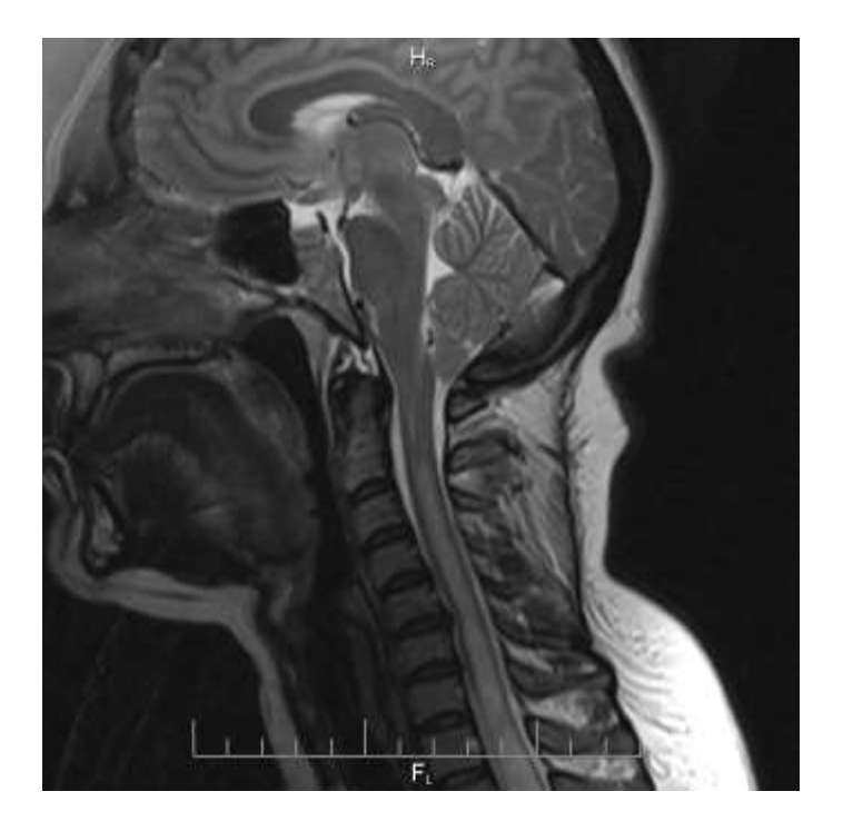
Figure 1 . In the spinal cord from the level of the C2 to the Th2 (in the visible range) were revealed areas with fluid signal, located in the upper segment, somewhat eccentrically – more on the right side, in the thoracic segment of the spine occupying the central part of the spinal column; dimension in the axial plane of approx. 9 x 6 mm – syringomyelic cavities [authors' material]