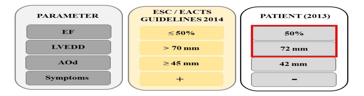
Table 2. Recommendations for the surgical intervention in patients with asymptomatic AR. LVEF/EF – ejection fraction, LVEDD – left ventricle end-diastolic diameter, AOd – aortic root diameter

Age, as an unmodifiable risk factor, worsens the prognosis of the surgery. Moreover, the individuals who underwent CABG, aortic or other heart valve surgery are in the special risk factor group. Multidisciplinary team decision-making to perform the operation should also take into account aetiology of AR, the life expectancy and operative risk in every patient.