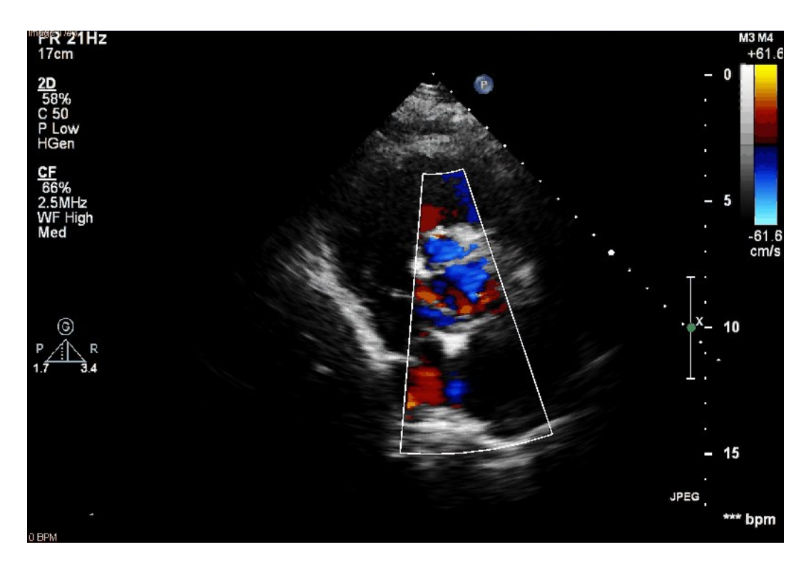
Figure 3. Transthoracic echocardiogram. Short sternal projection. Reverse blood flow is visible. Qualitative (on a scale from 1 + to 4+) assessment of the range of the return wave of aortic regurgitation.