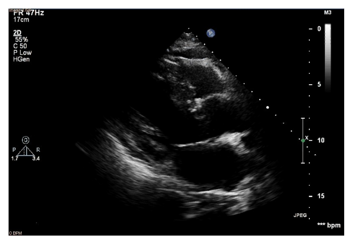
Figure 1. Transthoracic echocardiogram. Parasternal projection in the long axis. A small volume of fluid is visible in the pericardial sac. Widening of the aortic bulb. Thickened aortic valve leaflets.