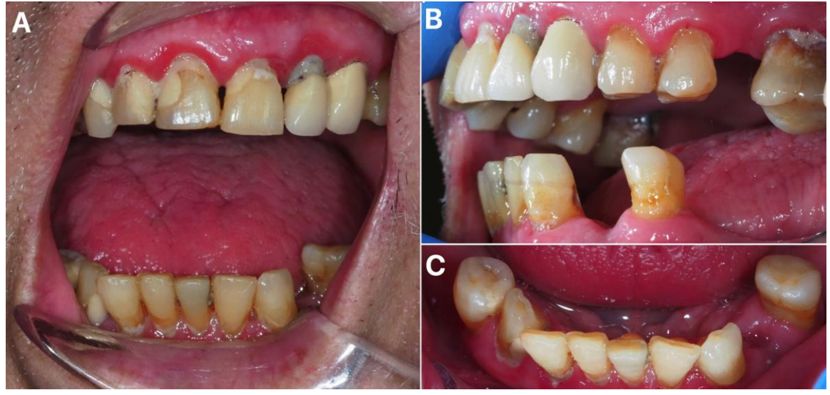
Figure 2. The oral condition of the other patient diagnosed with Parkinson's Disease. Patient present a lack of numerous side teeth. The patient's front teeth, especially in the maxilla, with numerous fillings. Picture A and C presents visible plaque and discoloration of the teeth near the gingival margin. In the picture A clearly marked redness of the gingival margin, indicating gingivitis

72-years-old female, living in good condition under the care of his wife. In 2000 he underwent post-traumatic subarachnoid hemorrhage, he was diagnosed with degenerative changes in the lumbar spine. In 2007, was diagnosed with Parkinson's Disease - and excerebration of the disease was between 2017 and 2018 - what manifest with weakness of the lower limbs, slowness of movement, trembling of the limbs. Patient cleans his teeth once a day with a manual toothbrush. He complains about dry mouth (especially in the morning). According to the interview, the deterioration condition of his teeth coincidence with the start of Parkinson's disease therapy. The patient was not able to name his medicaments. The patient claims that his visits to the dentist are fairly regular.