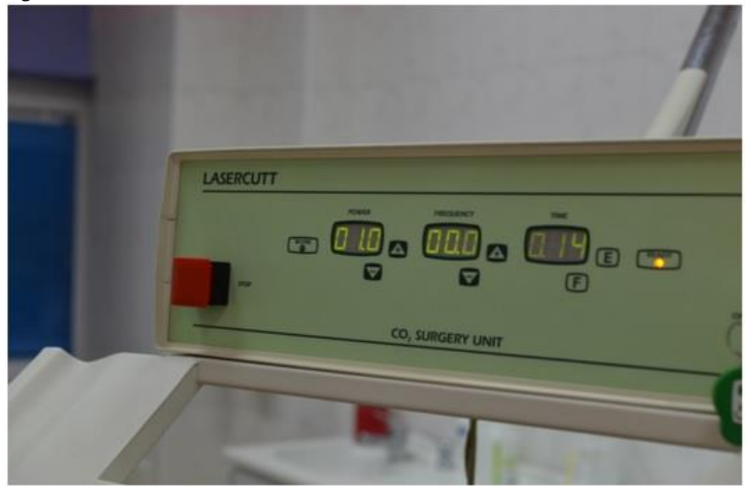
Fig.4 Surgical excision of the lesion with carbon dioxide laser