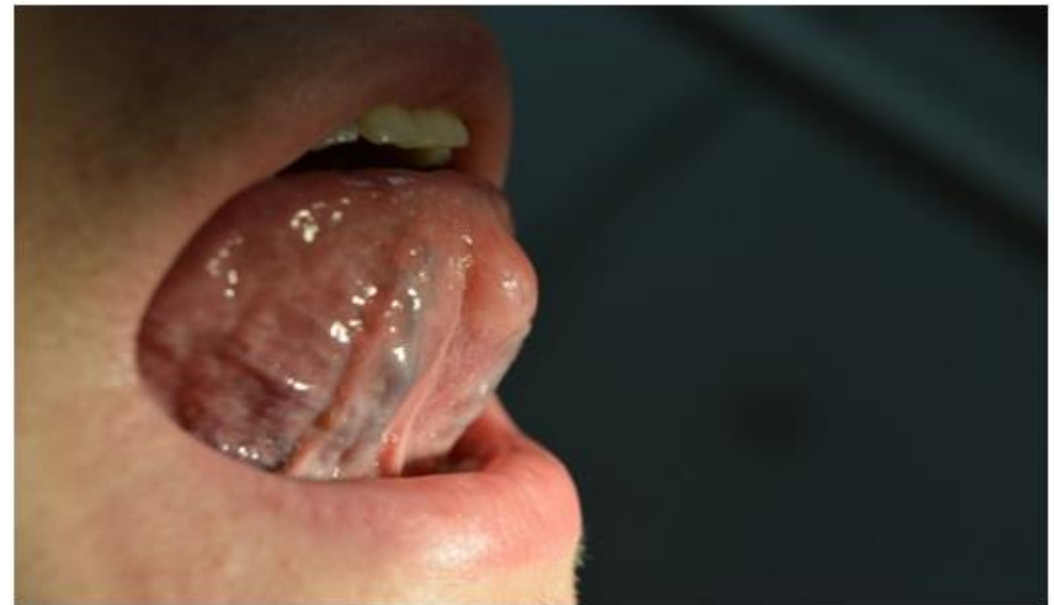
Fig.2. Lesion of the ventral side of the tongue