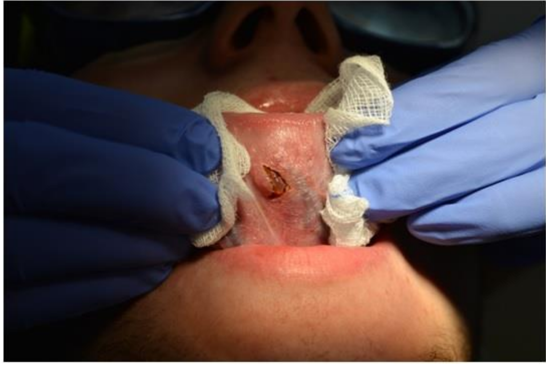
Fig. 5. In local anaesthesia the lesion was cut using a focused laser beam.