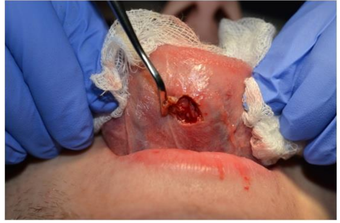
Fig. 6. The lesion was enucleated