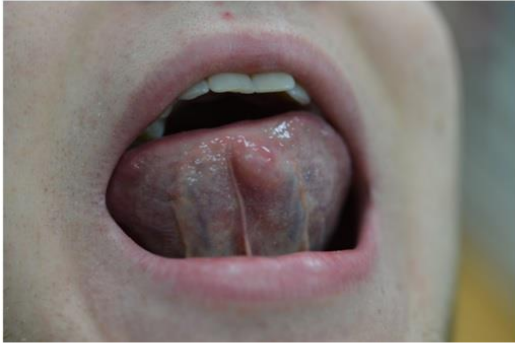
Fig.1. Lesion of the ventral side of the tongue