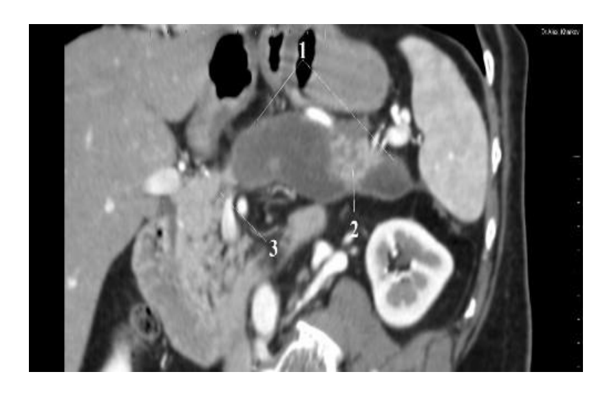
Fig.2. CT-scan visualization: 1 – acute pseudocyst of pancreas, 2 – parenchyma of pancreas, 3 – increasing Virsung's duct