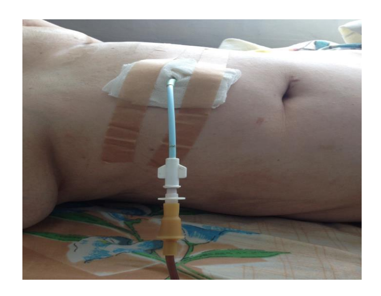
Fig.3. External drainage cavity of acute pancreatic pseudocyst for the type «pig tail»

In 2 patients without organ dysfunction (SOFA <3) or with moderate dysfunction Authority (SOFA to 8) laparotomy performed with the formation was cystopancreatoenteroanastomosis after conservative treatment and the formation of the wall. In 15 patients with infected PC software do them puncture under the control of ultrasound, including 2 patients after failure of puncture, performed by external drainage of software PC controlled ultrasonography with the installation of drainage for the type «pig tail» for their organs, and 1 patient imposed cystopancreatoenteroanastomosis after conservative treatment and the formation of the wall PCs. In 9 patients with limited pancreatic necrosis and the presence suppuration of acute software PC with external drainage operation includes PC following suturing of the abdominal cavity, including 2 patients accompanied drainage cavity tamponade large PC bonnets by methodology clinic (fig.4).