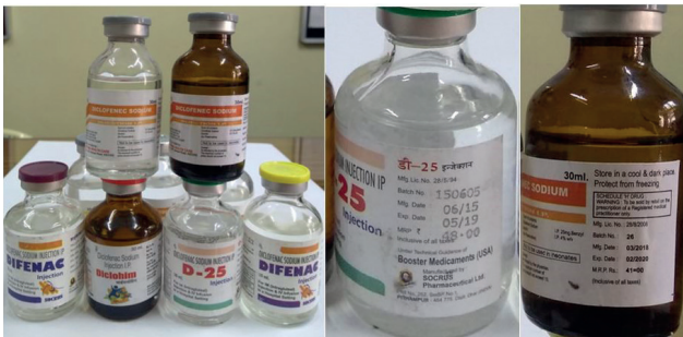
Figure 4. Diclofenac NSAID: 30 ml vials available in the market for sale by different brand names (left). Manufacturing date (06/2015 and 03/2018) and Expiry date (05/2019 and 02/2020) may be noted on the vials on the right

All the doctors interviewed knew that veterinary use of Diclofenac was banned by the government, as vultures were vulnerable to poisoning effects. They were also aware that Meloxicam was available as a safe substitute. This alternative drug was easily available in the surveyed hospitals and several shops. However, diclofenac sodium in small vials (1 ml to 3 ml) was available in almost all the shops, labelled with fourteen different trade names, including Voveran 1 ml. Sodium diclofenac pills for human use was also available in the market. There were also larger vials (30 ml) of diclofenac sodium (Fig. 4) with different names (D-25, Difenac, Diclofenac Sodium and Diclohim). Some of the vials had statutory cautions “Not for veterinary use and Not to be used in neonates” and some with only “Not to be used for neonates”. Such vials currently available in the market have valid periods of two to four years from 2015–17 to 2018–20.