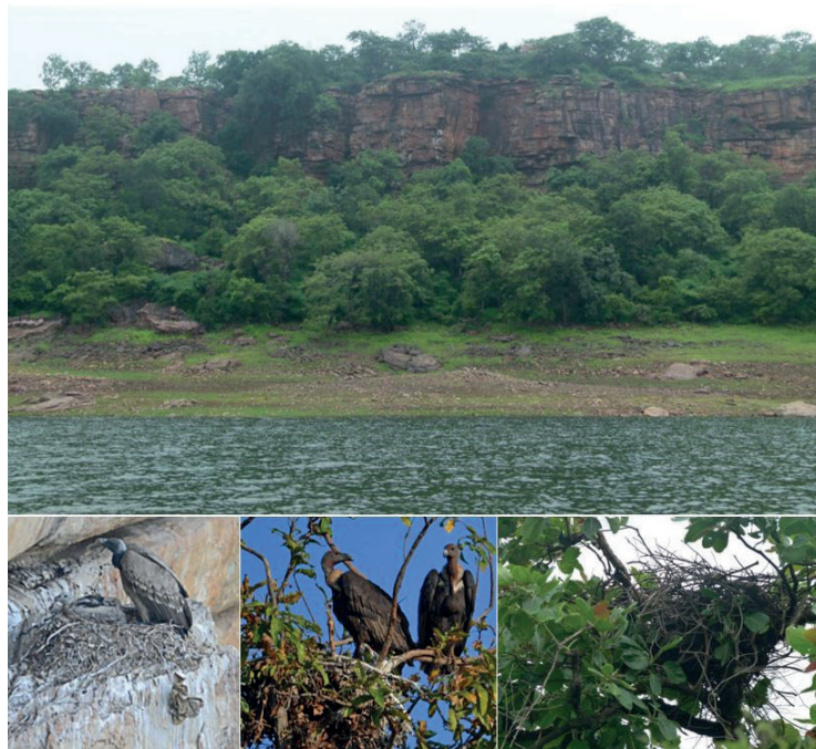
Figure 3. Vulture landscape and nesting. Top: An ideal landscape for vultures in Gandhisagar Wildlife Sanctuary, the vertical cliff and nesting trees on the table land and Chambal river in close proximity. Bottom left: Active nest of cliff nesting Long-billed vulture (an adult with a chick on the nest). Bottom centre: Inactive nest of White-rumped vulture (two adults without chick/ juvenile on the nest). Bottom right: Abandoned nest without vulture occupancy in breeding season

Aband = Abandoned, NP = National Park, WS = Wildlife Sanctuary