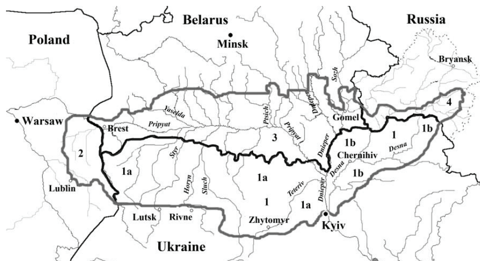
Figure 1. Schematic map of Polesie. Map symbols: 1 – Ukrainian Polesie (1a – Right-bank, 1b– Left-bank), 2 – Lublin Polesie, 3 – Belarusian Polesie, 4 – Nerissa and Desna Polesie

According to various literature sources, forest areas occupy 26-29% of the territory of Ukrainian Polesie (Andrienko et al., 2006). The considerable distribution of sand deposits in Ukrainian Polesie causes large areas of pine forests. Climatic conditions of Polesie are favorable for the