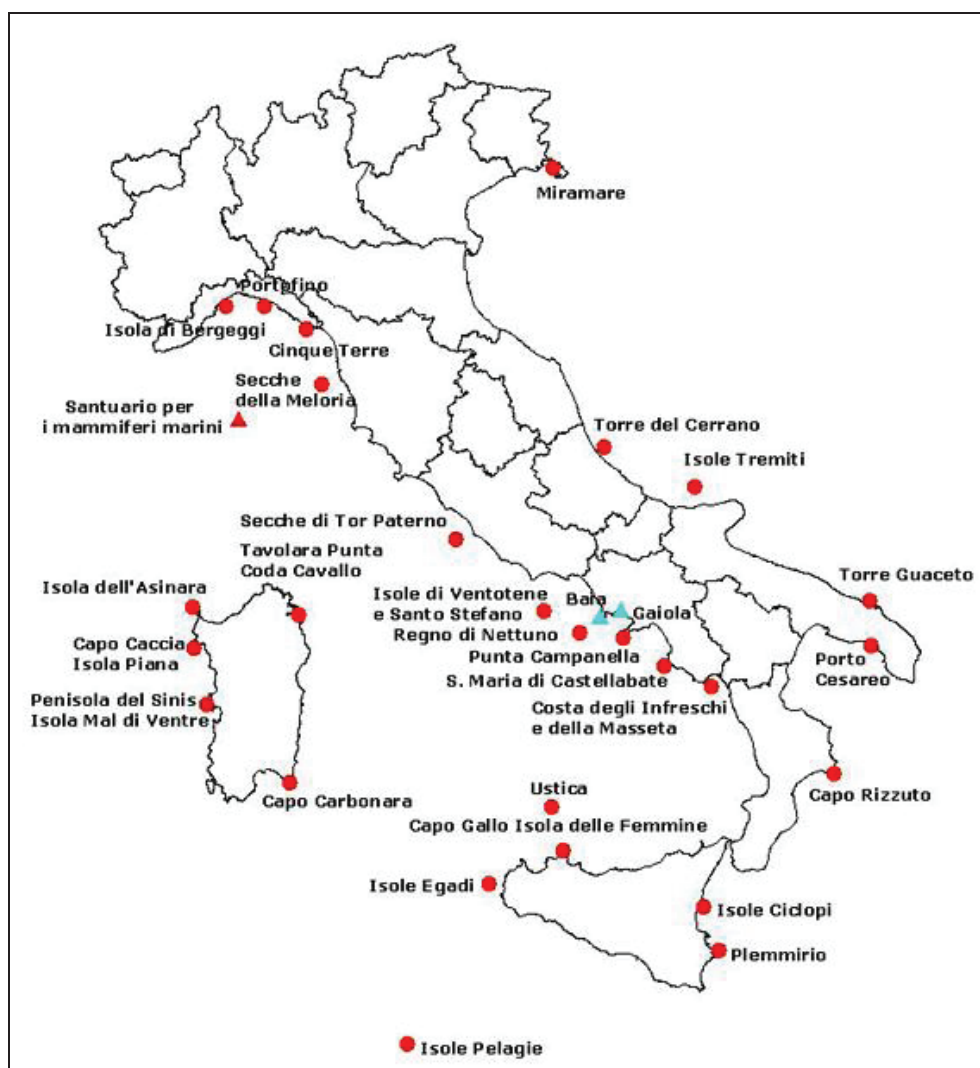
Figure 1. Network of Italian Marine Protected Areas