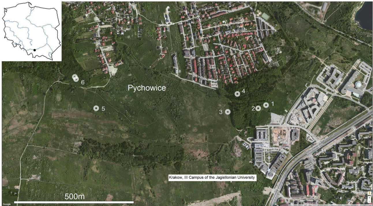
Figure 1. Location of the investigated sites, numbered 1-6, in the vicinity of Jagiellonian University Campus III; satellite photo