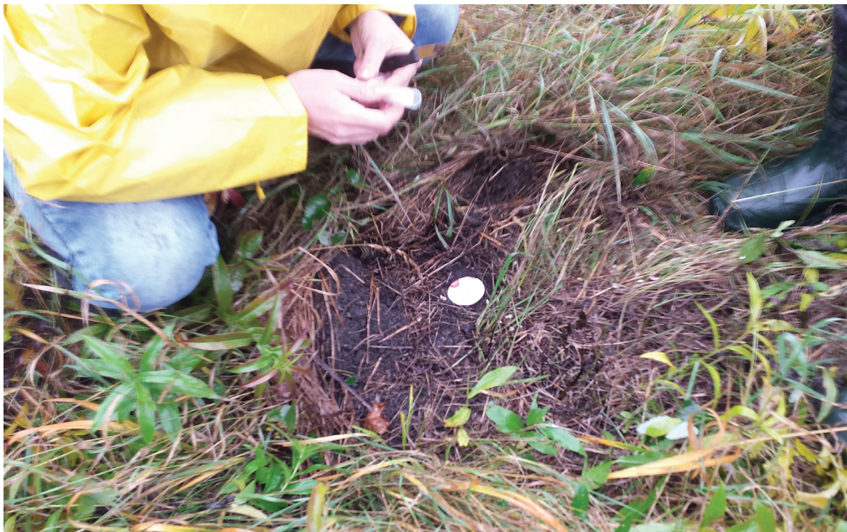
Figure 2a. Sampling for palynological studies from the surface of the soil; Photo D. Nalepka