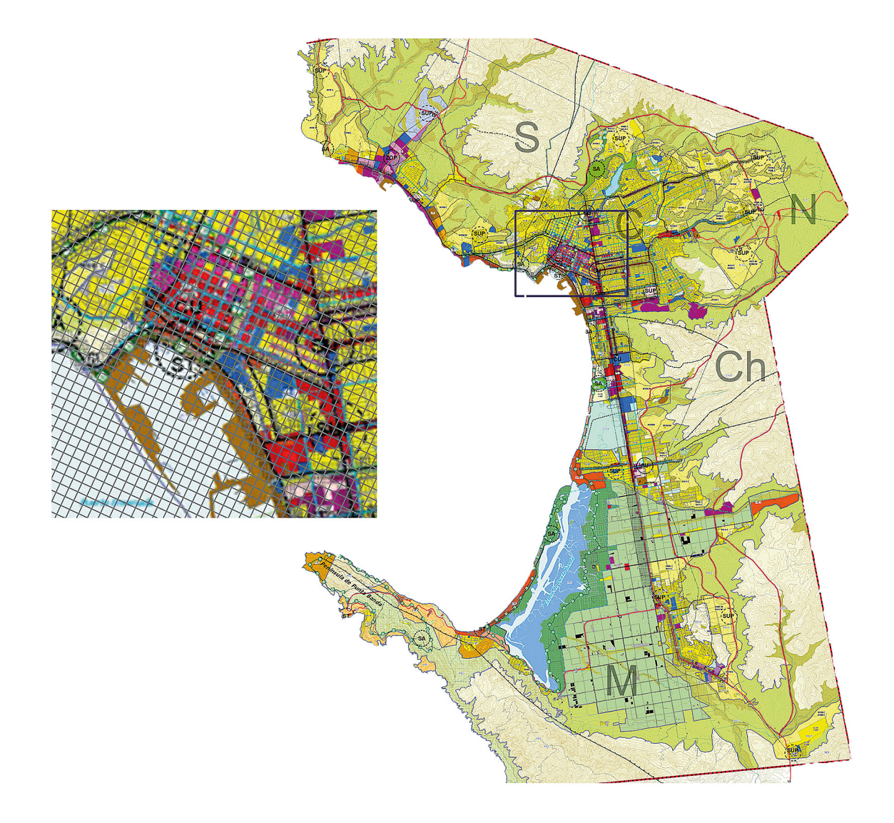
Fig. 2. Parcels and grid for the estimation of the Dissimilarity Index in Ensenada

0 to 1, where zero means a homogeneous land. The calculation of the dissimilarity index is made by dividing the city in equal parcels (100x100 meters in this case). Each parcel receives a value depending on how many different uses this parcel has. Then an average is calculated for all the parcels and divided by the total number of land uses. For this variable, only three maps were provided based on the existing land use maps of 1995, 2005, and 2014. The mix of land uses is assumed to encourage city dwellers to walk and cycle in order to reach nearby destinations; thus, a neighbourhood with a high mix of land uses may provide a quality against personal car use, at least for local trips.