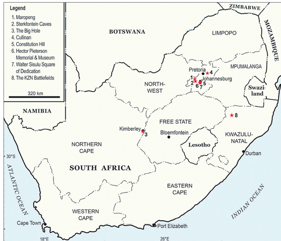
Fig. 1. Location of the Eight Heritage Sites, rated by the Cultural Tourist Guides in the on-line survey