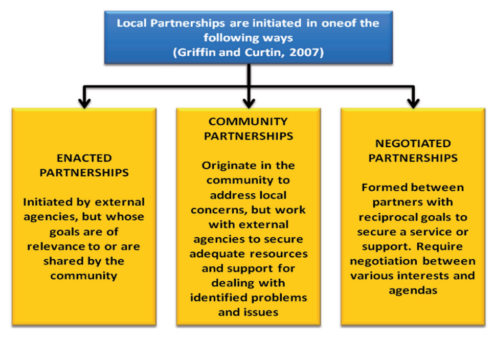
Fig. 3. Ways of initation of local partnerships

The "true" reasons for local cooperation. In most cases, local PPPs respond to a call or external opportunity and VET partnerships are not an exception. One of the key elements that constrains the process of formation and consolidation of VET partnerships is the availability of external funds. The long-term sustainability of cooperation is compromised when the reason for cooperating is mainly linked to a funding opportunity. However, in the context of little or no prior cooperation, such incentives can lay the grounds for long-term cooperation, as long as the benefits are clearly perceived and valued by partners (Fig. 3).