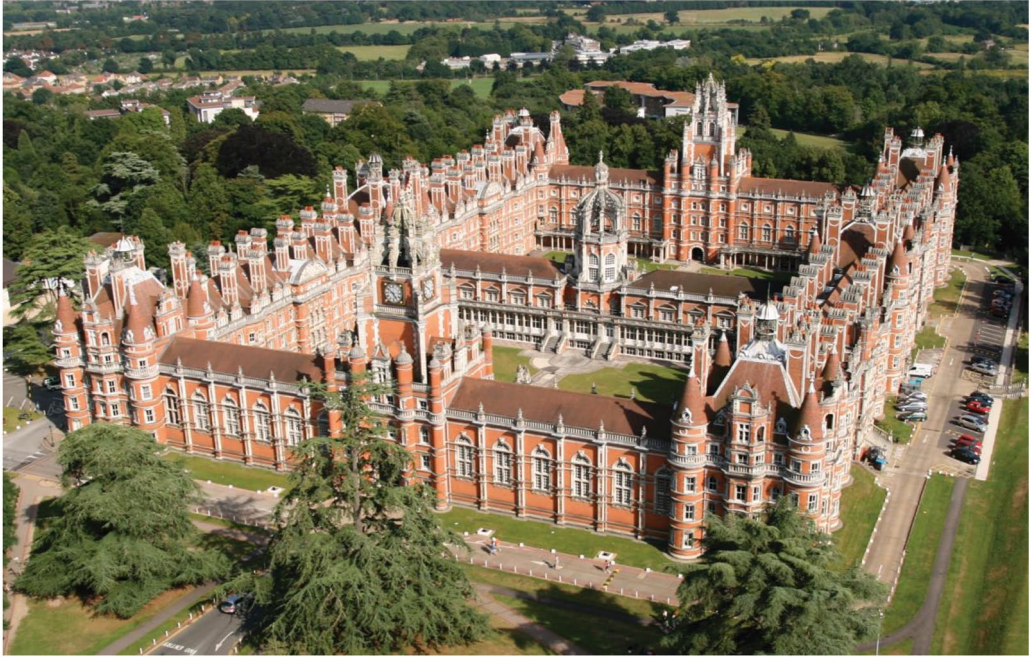
Figure 1. Royal Holloway College: the Founder's Building.

communication within organizations (Boxenbaum et al., 2018; Höllerer et al., 2019). We add to these studies by showing that spatial, aural, sensual and visual modes of the multimodal material object engage with each other, as well as with further verbal and numerical modes, in always different ways: sustaining and opposing each other, evolving or even disappearing, in the craft of rhetorical composition. We show that this engagement can be explained through the features of the messy object.