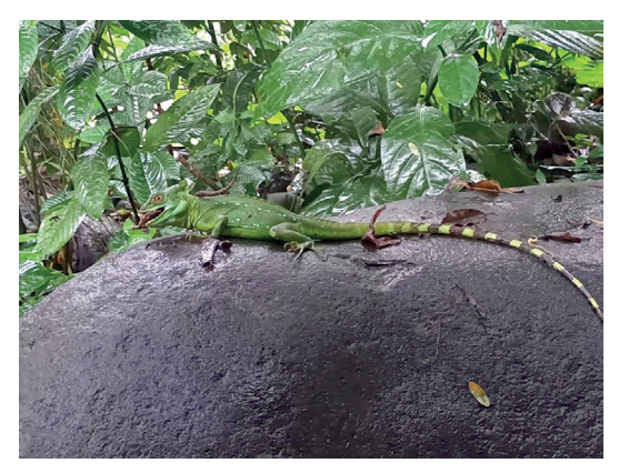
Figure 2. An adult female Green Basilisk (Basiliscus plumifrons) feeding on a Yellow-spotted Night Lizard (Lepidophyma flavimaculatum) at Selva Verde Lodge, Sarapiquí, Heredia, Costa Rica.

Several lizards feed on arthropods as juveniles and then switch to other feeding habits such as herbivory, although they may include small vertebrates at least occasionally (Astorga-Acuña and Mora 2023). Some are diurnal sitand-wait predators such as leopard lizards (Gambelia Baird, 1859) that feed primarily on arthropods but occasionally take smaller lizards (O'shea 2021). Some have obvious cranial adaptations to subdue other lizards, such as Burton's Snake-lizard (Lialis burtonis Gray, 1834) from Papua New Guinea (O'shea 2021). The large lizards of the Central American region, mainly Iguana and Ctenosaura are primarily herbivorous (Mora 2010). Most of them, at least opportunistically, take vertebrate prey (Astorga-Acuña and Mora 2023). The Utila Spiny-tailed Iguana (Ctenosaura bakeri Stejneger, 1901) preys on lizards such as Hemidactylus frenatus Duméril and Bibron, 1836 (Hallmen and Hallmen 2011) and juvenile Green Iguanas in captivity (Dirksen and Gutsche 2006). The Roatán Spiny-tailed Iguana (Ctenosaura oedirhina De Queiroz, 1987) has captured juvenile Green Iguanas (Hendry and Gandola