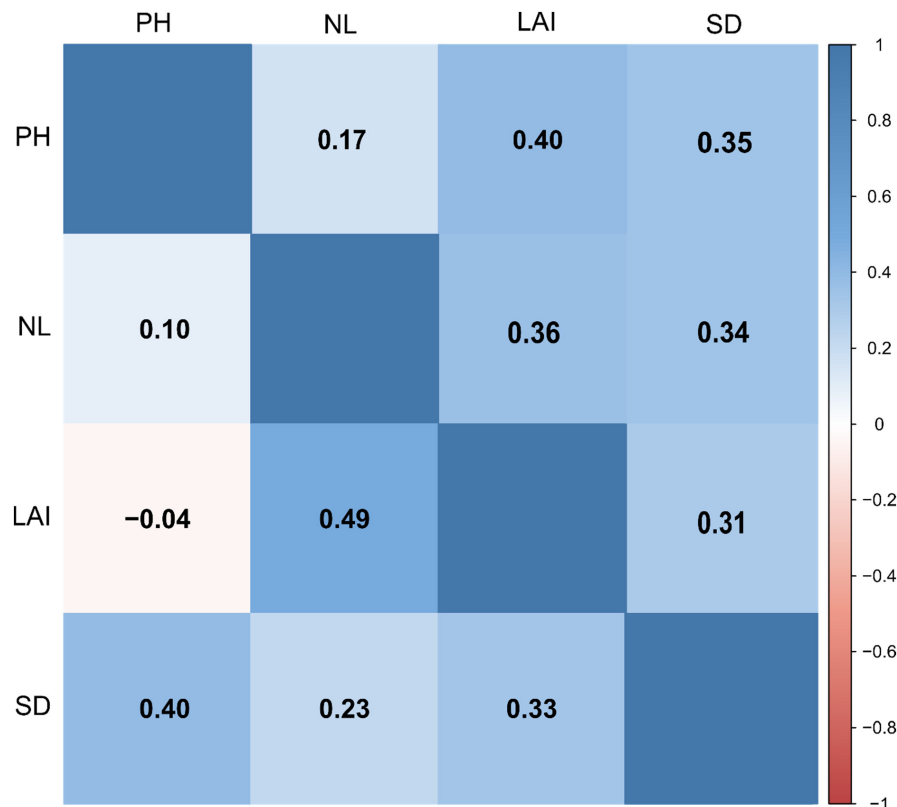
FIGURE 1 Scatterplot containing Pearson's correlation between the variables plant height (PH), number of leaves (NL), leaf area index (LAI) and stem diameter (SD) evaluated in 32 Saccharum complex genotypes grown under presence (upper diagonal) and absence (lower diagonal) of saline stress.

in the literature, which have reported that stem diameter is a growth trait with slight variation since it depends more on the genetic traits of the genotype than environmental factors (Capone et al., 2011; Oliveira et al., 2011). Thus, the larger stem diameter observed in the genotypes G1, G11 and G24 under salinity is possibly related to these genotypes' intrinsic characteristics. Different responses to salt tolerance within sugarcane genotypes occur through their high genetic variability, limiting the persistent selection pressure for individual traits related to salinity tolerance (Chiconato et al., 2019).