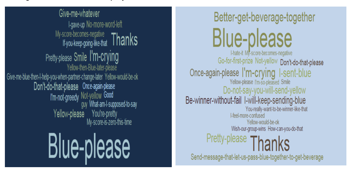
Figure 2 Messages sent to the behind players

Note. Left (Session 1 and 2); Right (Session 3 and 4). The size of message is proportional to its relative frequency in each picture.