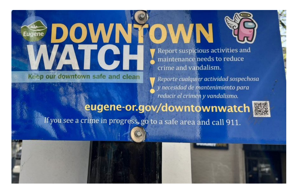
Figure 2: "Downtown Watch" sign