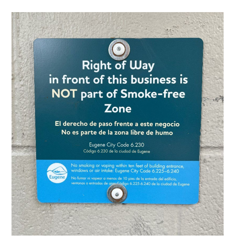
Figure 9: "Not part of Smoke-free Zone" Sign