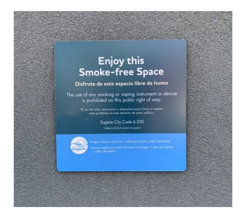
Figure 8: "Smoke-free Space" Sign