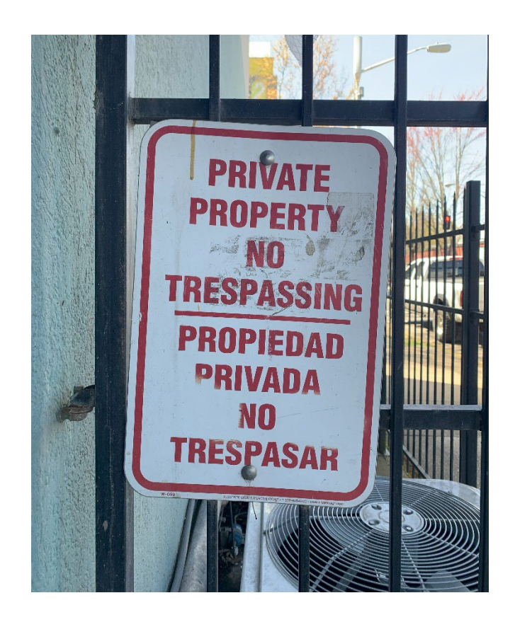
Figure 18: "No Trespasar" Sign