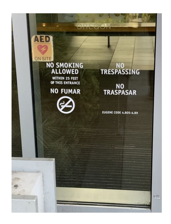
Figure 22: "Within 25 Feet" Sign