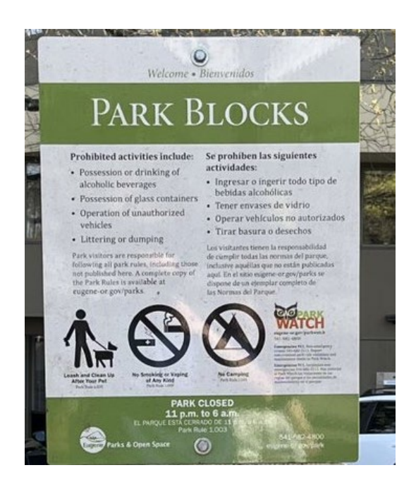
Figure 1: Sign "Park Blocks"