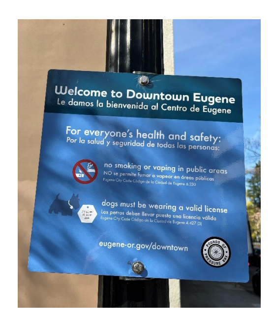
Figure 3: "Welcome to Downtown Eugene" Sign