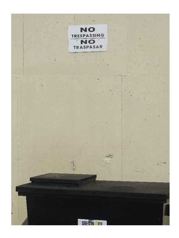
Figure 16: "No Traspasar" Sign