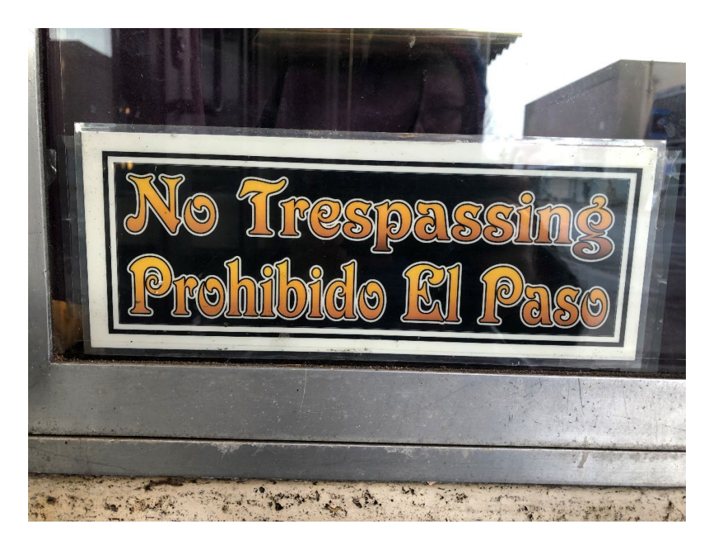
Figure 15: No Trespassing, Orange Letters Sign