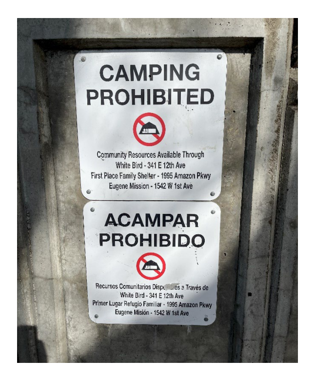
Figure 14: "Camping Prohibited" Sign