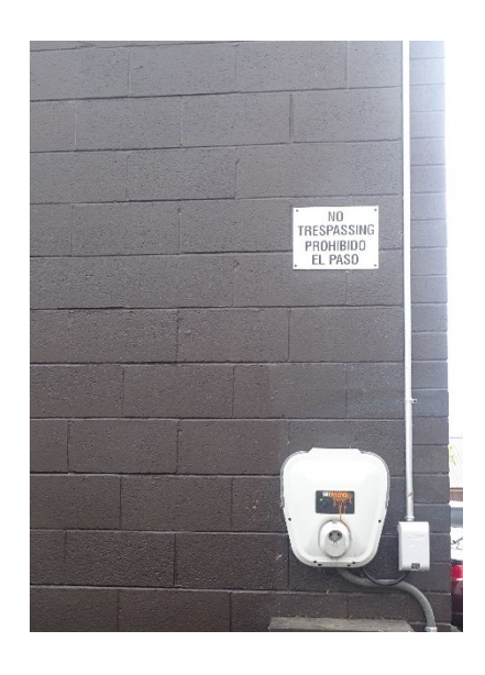
Figure 17: No Trespassing, On Wall Sign