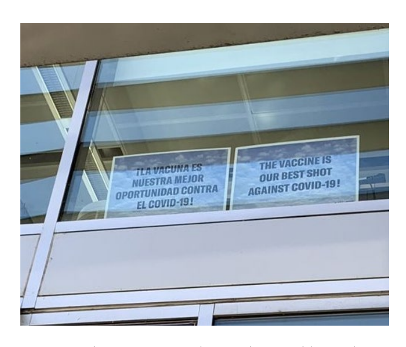
Figure 24: "Best Shot Against Covid-19" Sign