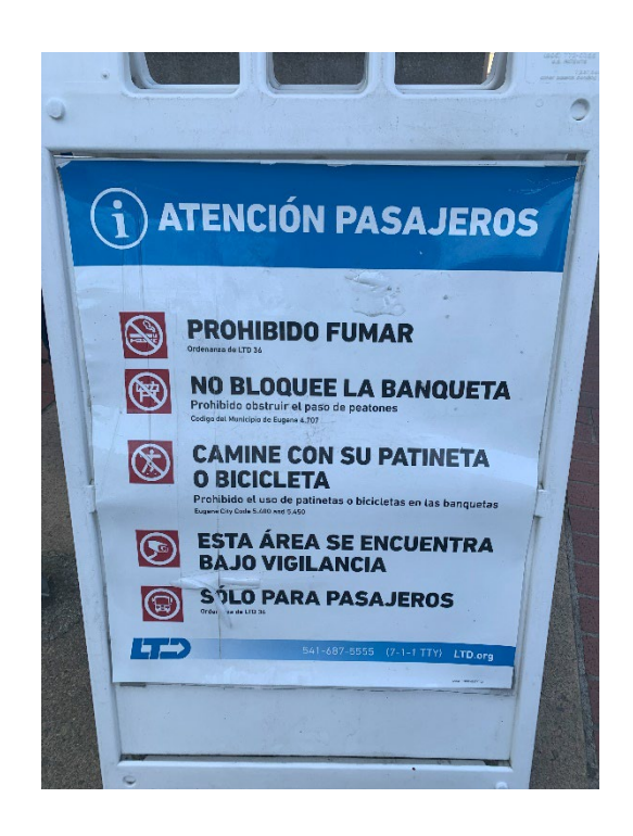
Figure 5: Public Transportation (A-frame) Spanish