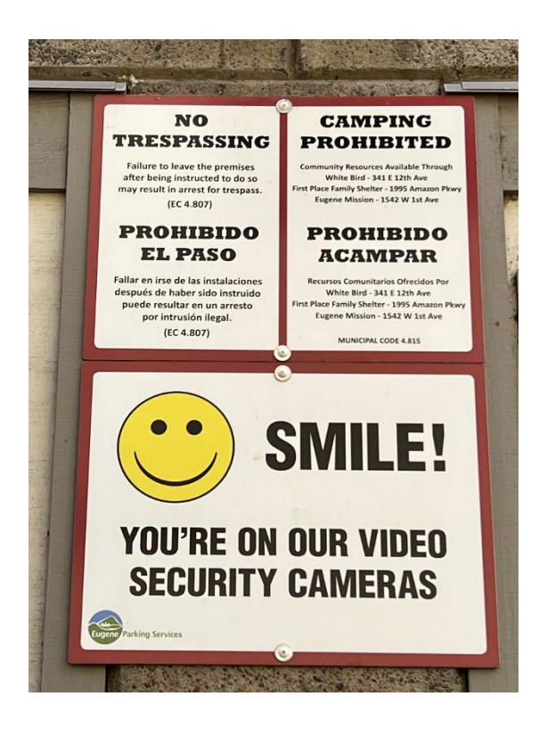
Figure 13: No Trespassing, No Camping, Smile Sign