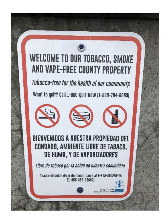
Figure 7: "Tobacco-free" Community Sign