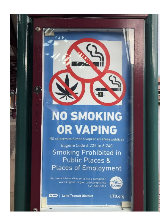
Figure 12: "No Smoling or Vaping" 2020 Sign, Version II