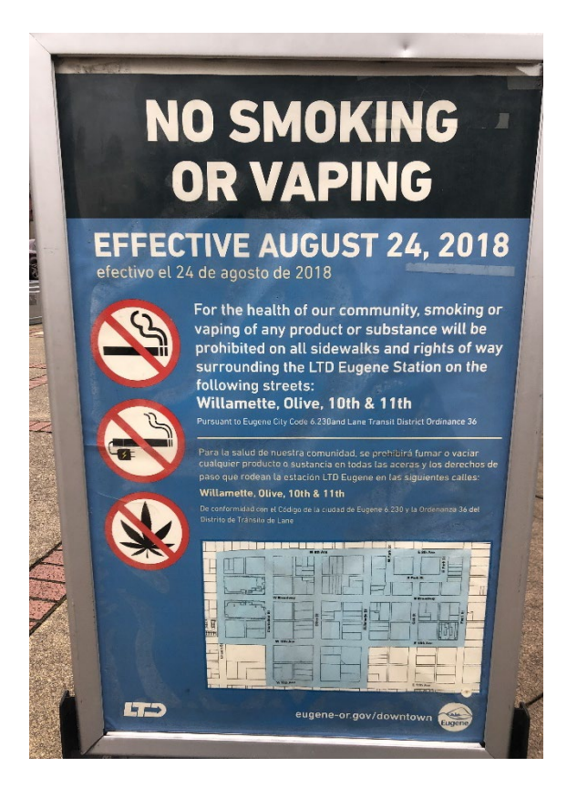
Figure 11: "No Smoking or Vaping" 2020 Sign, Version I