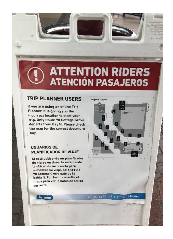
Figure 4: Trip Planner Warning