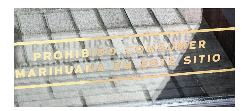
Figure 27 & 28: Business Door