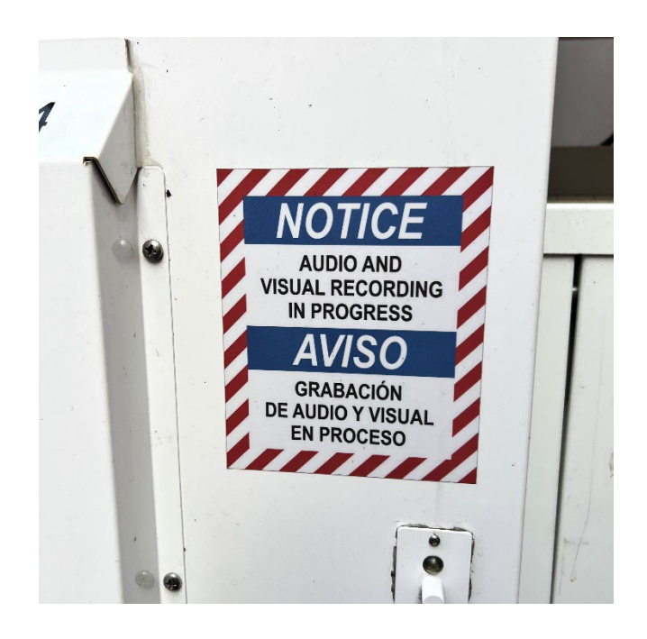
Figure 21: Audio Notice Sign