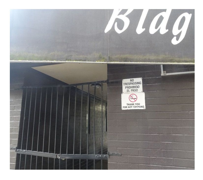
Figure 20: No "Thank You" in Spanish Sign