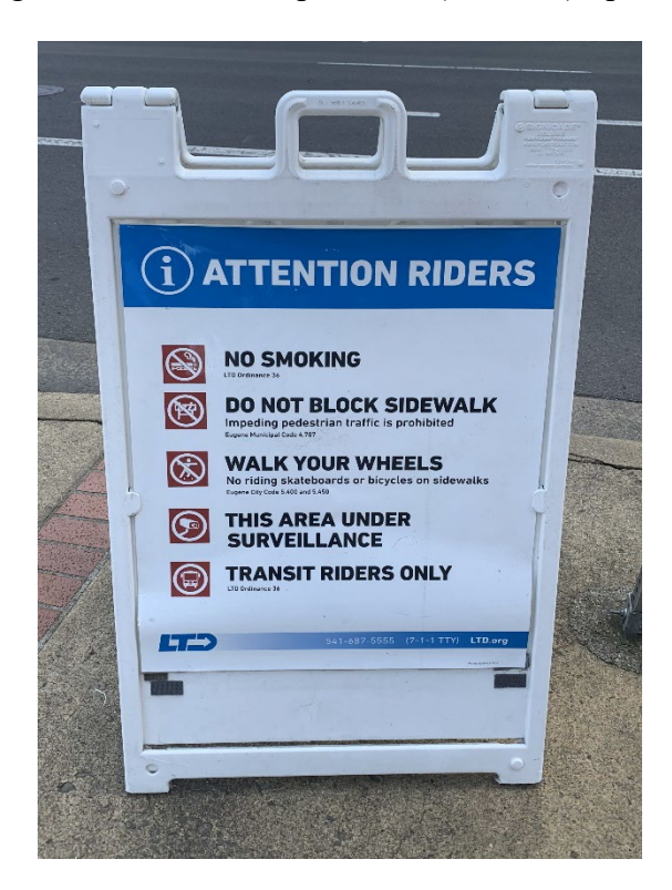
Figure 6: Public Transportation (A-frame) English