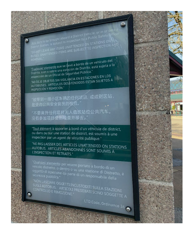
Figure 25: "5-language Bus" Sign