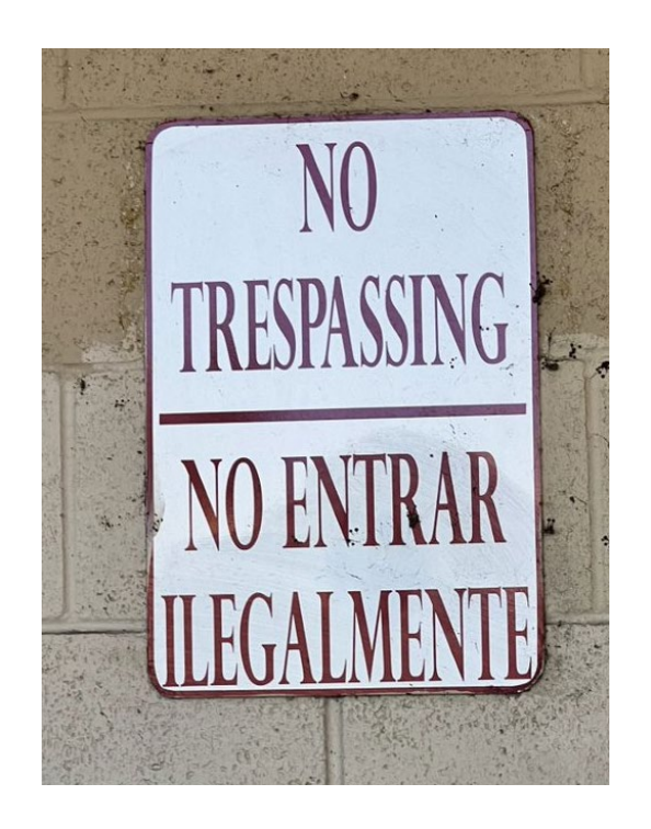
Figure 19: No Trespassing – Illegal Sign