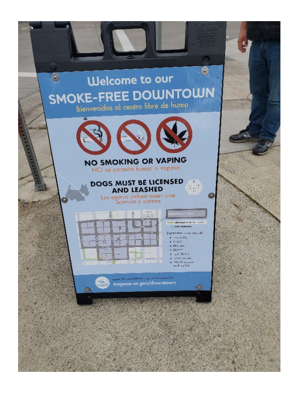
Figure 10: "Smoke-free Downtown" (A-frame from 2020)