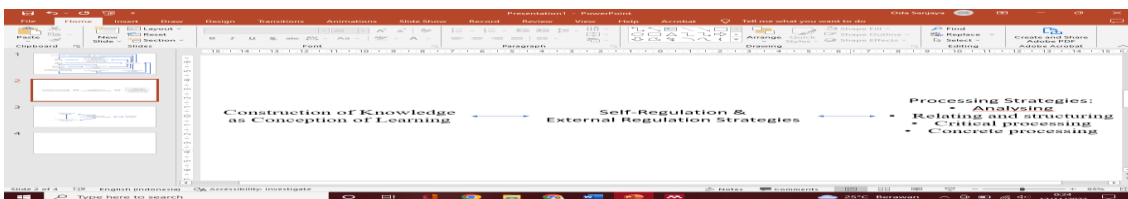
Figure 2. Active meaning-directed learning pattern

This active meaning-directed learning pattern is the only pattern that uses self-regulation strategies in learning. The learning process is managed personally through planning learning activities, monitoring progress, diagnosing problems, testing one's results, adjusting, and reflecting. This pattern also does not necessarily release external regulation strategies. Instead, external regulation is used to guide and support self-regulation.