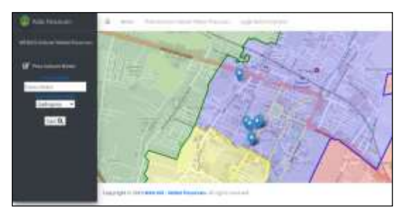
Image 5. Distribution Map of the Furniture Industry Based on Certain Districts

Users can also access a map of the distribution of the Pasuruan city furniture industry by sub-district, as shown in Image 5.