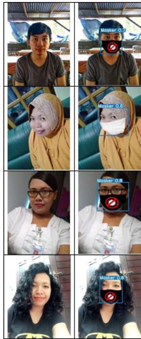
Fig. 2. The application of a mask to a face image

Figure 2 illustrates the difference between two images based on the presence or absence of a mask, showcasing the left column without a mask and the right column with a mask. These results emphasize the importance of testing and evaluating the accuracy of mask detection, along with its suitability for various scenarios [20]. The YOLO-v5 method is an advanced algorithm known for its effectiveness in object detection [27], making it highly suitable for detecting masked faces in public spaces as a preventive measure against the spread of COVID-19 [31].