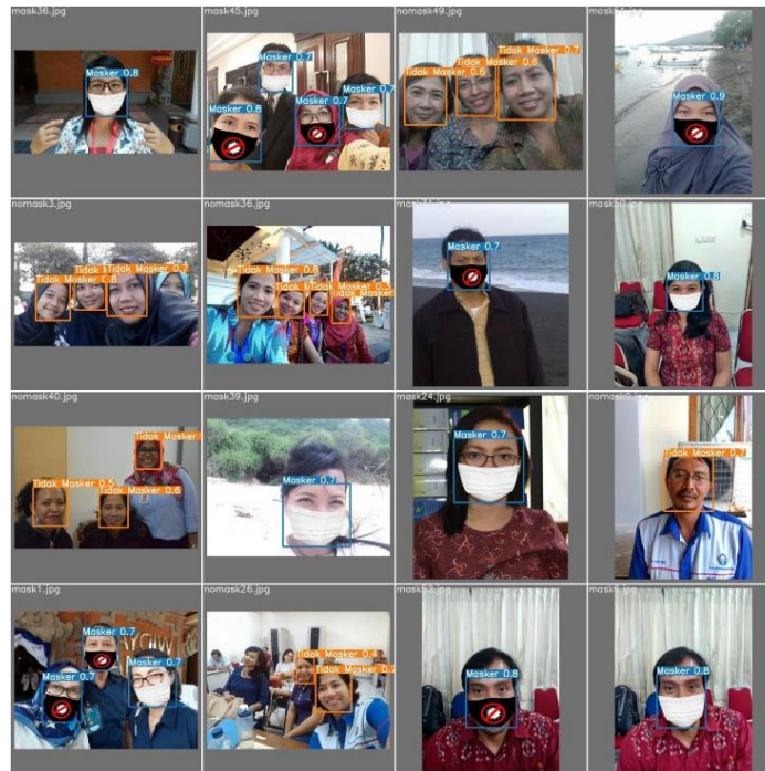
Fig. 4. Training System test results with predictive probabilities