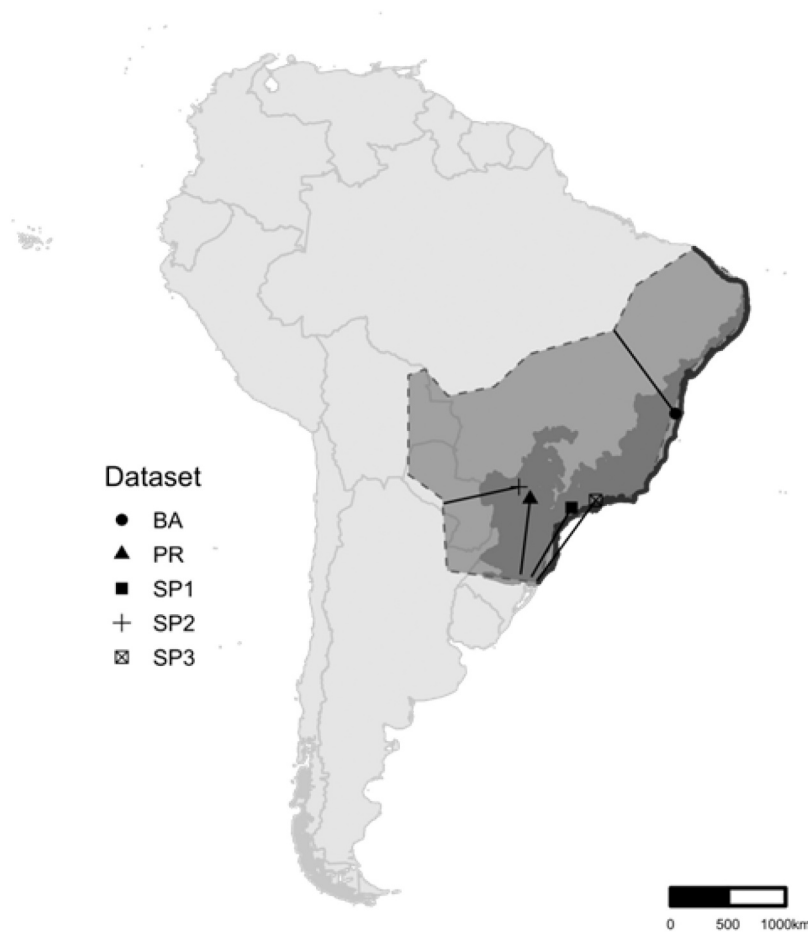
Fig. 1. Example of distances measured to the nearest continental edge of a hypothetical species' geographic range. The points on the map show the location of each of the five datasets, and the lines connected to them show each respective distance to the nearest continental range edge (dashed line), the dark grey bold line is the coastal range edge which was excluded from analyses, the lighter grey filled area from the dashed line to the bold line represents a hypothetical geographic distribution and the darker polygon underneath shows the extension of the Brazilian Atlantic Forest. The map of South America (with its country boundaries) appears in the background in light-grey.