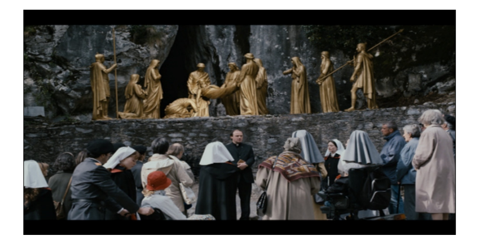
Figure 12. The pilgrims at Lourdes Grotto.