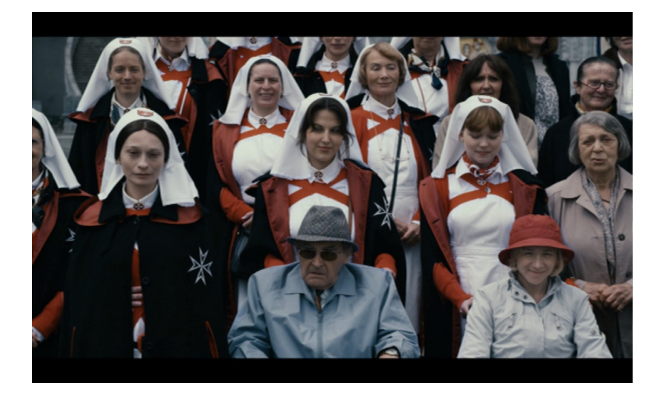
Figure 20. Lourdes's pilgrims line up to have their portrait taken.