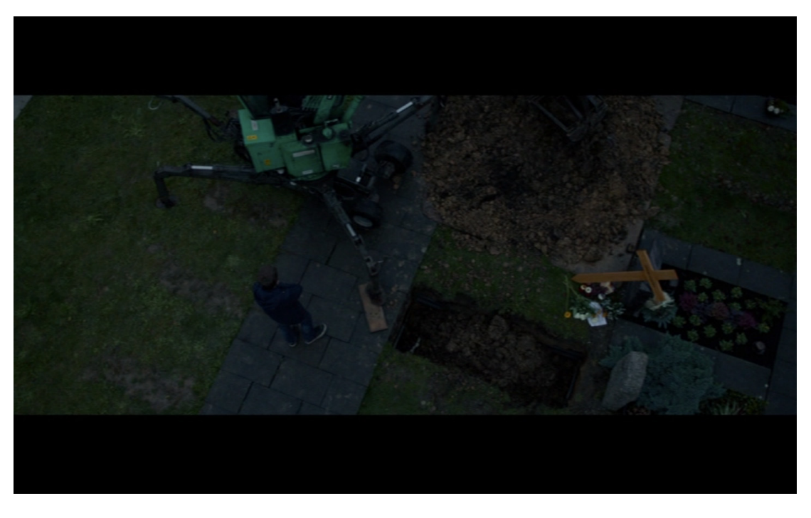
Figure 24. Christian stands at Maria's grave in the final sequence of Stations of the Cross.