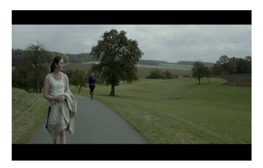
Figure 14. Chapter 2, Stations , "Jesus carries his cross": Maria as Madonna of the Meadows.