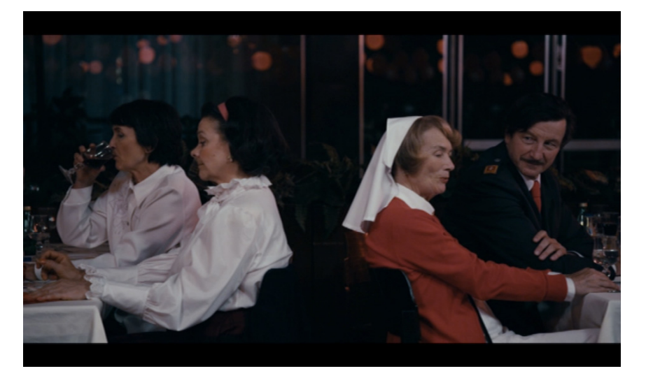
Figure 8. The "greek chorus" of Lourdes , lined up in a reverse V formation.