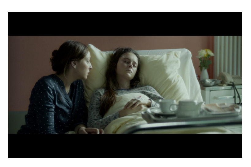
Figure 15. Chapter 11, Stations , "Jesus is nailed to the cross": Maria as Imago Pietas.