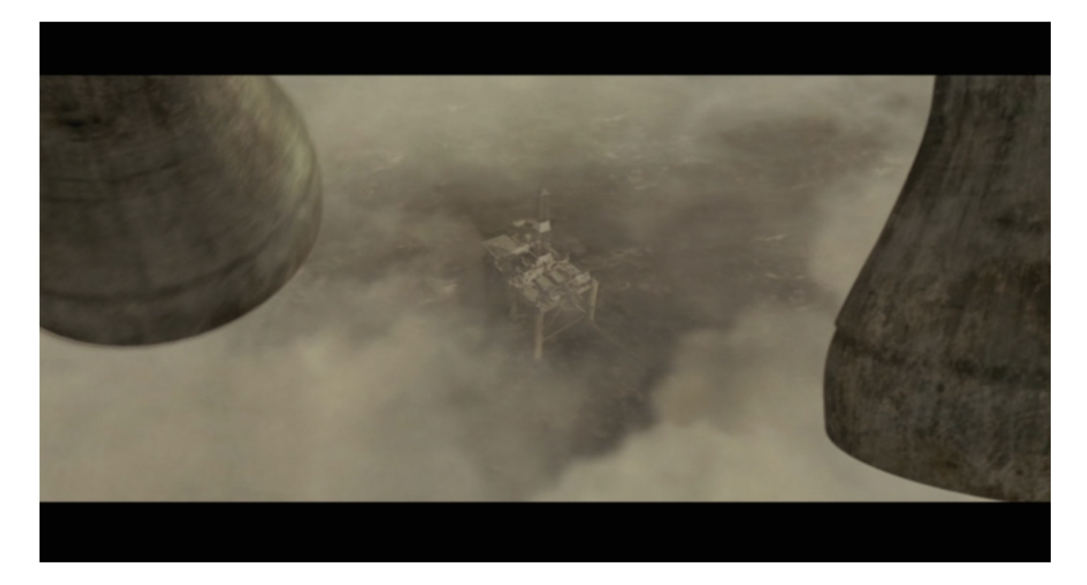
Figure 23. The final shot of Breaking the Waves makes a move to the supernatural, as heavenly bells peal.