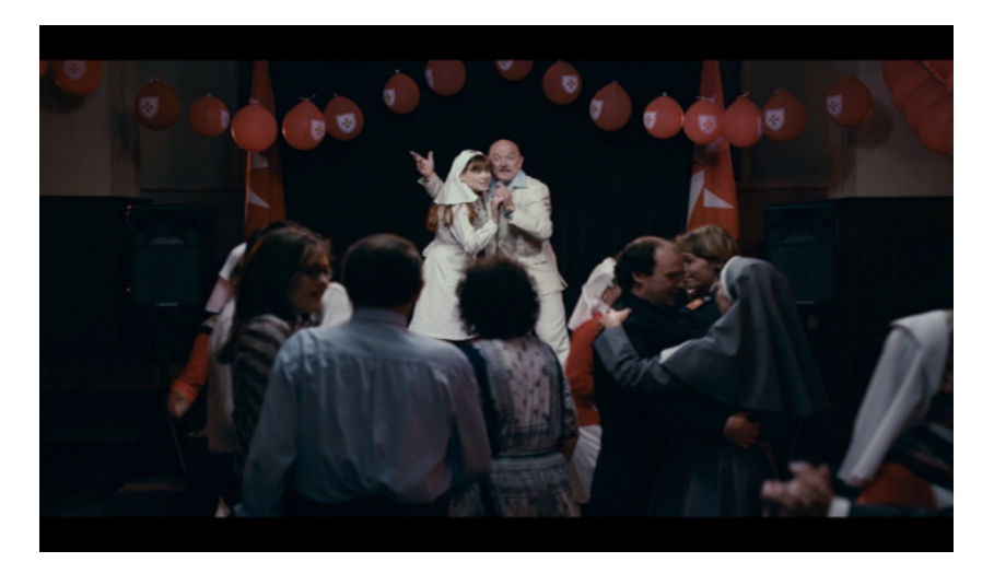
Figure 10. A planimetric shot sees the party continuing.