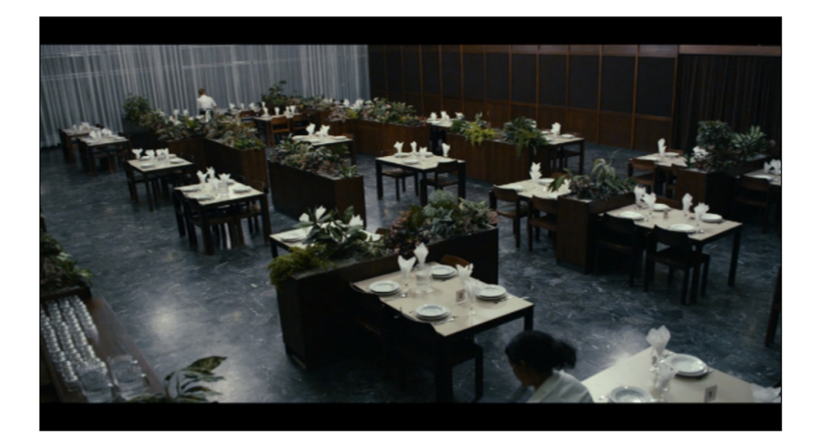
Figure 1. The opening shot of Lourdes .

The events of Lourdes turn around the visit of a group of pilgrims and their carers, members of the Order of Malta led by the devout Sister Cecile, to the holy site. Shot by Martin Gschlacht, with production design by Katharina Wöppermann, the film is cast in a heavily restricted colour palate consisting of muted colours with strong elements of fire engine red and cerulean blue: the red of the uniforms of the Order of Malta and the blue of the Virgin Mary [7]. It opens with a high angle, wide shot of an empty hotel conference centre, which slowly fills from either side of the screen with characters, including Christine (Sylvie Testud), pushed in her wheelchair into the centre of the shot (Figure 1). A certain theatricality in the film's staging and shooting is thus announced from the outset, and Hausner explains that throughout the film, "the actors move almost as if they were in a ballet—they move in and out of a static frame that for its part stays detached and cool" [7]. She adds that the camera, "is like God's Eye—observing, never interfering" [7].