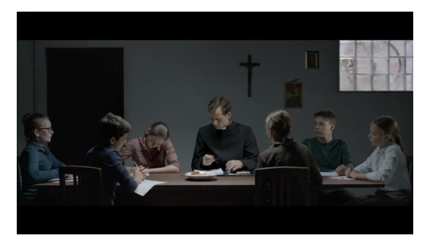
Figure 13. The opening scene of Stations of the Cross .

back door of the room) look more like two-dimensional planes overlapping (as rectangles) rather than a receding series of volumes. Despite its actual depth, the recessive image feels very flat.