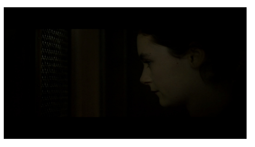
Figure 18. Chapter 5, Stations, "Simon of Cirene helps Jesus to carry the cross".