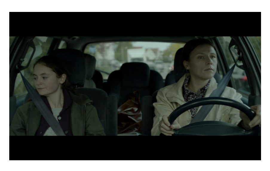
Figure 19. Chapter 4, Stations: "Jesus meets his mother".