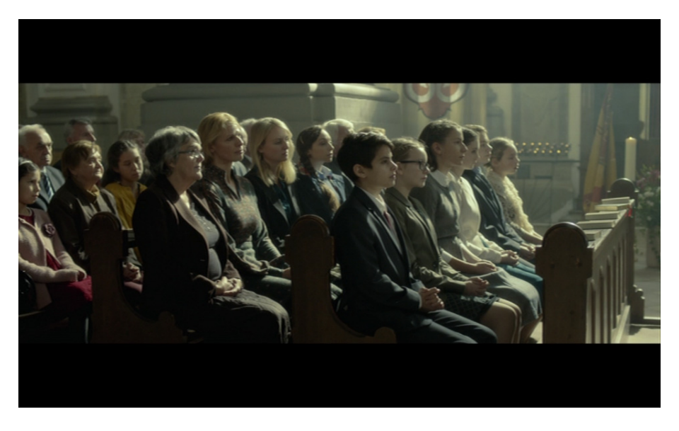
Figure 16. Chapter 9, Stations, "Jesus falls for the third time".