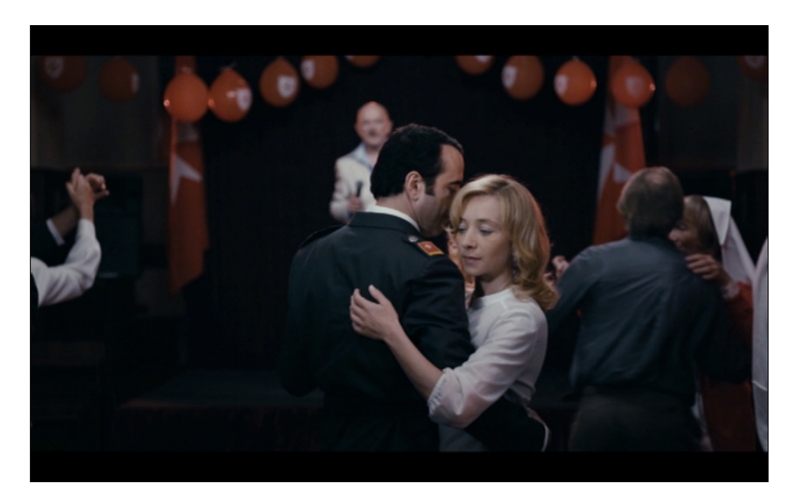
Figure 5. A closer shot of the dance.