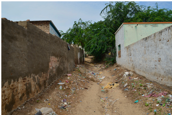
Fig. 7. A typical street in the village.