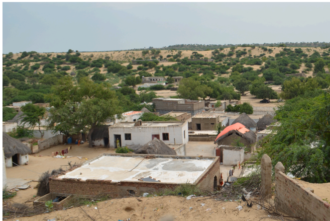
Fig. 6. Newer houses built with burnt bricks and concrete roofs.