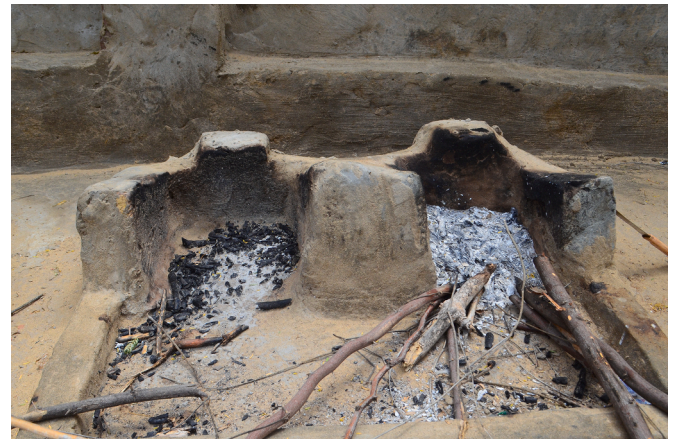
Fig. 8. Mud cookstove with wood residue.