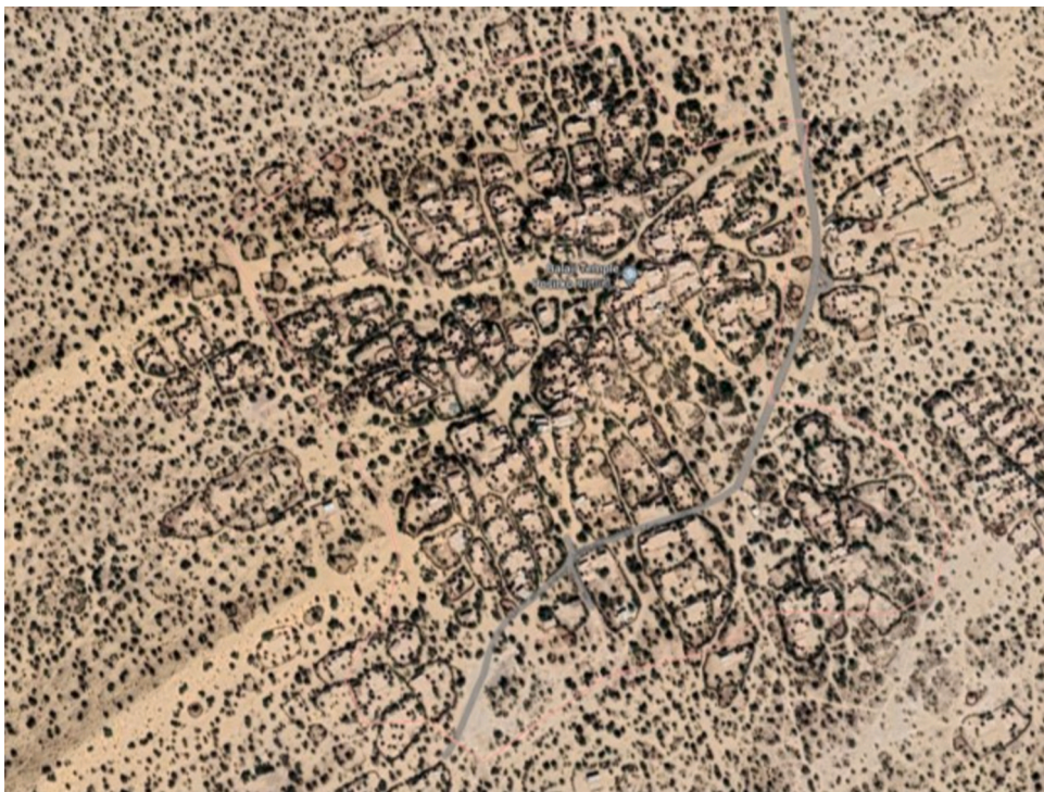
Fig. 2. Aerial map of village Helario.

% for girls [51]. In addition to the lack of education, lack of proper health services and inadequate facilities result in malnutrition and high mortality rates. Female health workers or trained birth attendants are not available in 69 % of the villages [51]. Women often work long hours, participating in crop cultivation, livestock management, dairy production, forestry, in addition to completing household chores including food preparation, fetching water and fuel, caring for children and the elderly [51].