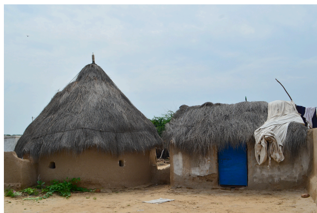
Fig. 4. Old houses made from mud with thatch roof.

For cooking, 84 % households indicated using firewood as the primary fuel for cooking. 17.2 % households indicated spending 3–6 h collecting fuel, while 66.5 % spent 6–8 h or more. Collection is done predominantly in the morning, from 08:00–11:00 (74.8 % of households). Further, 95.4 % households primarily used a self-made