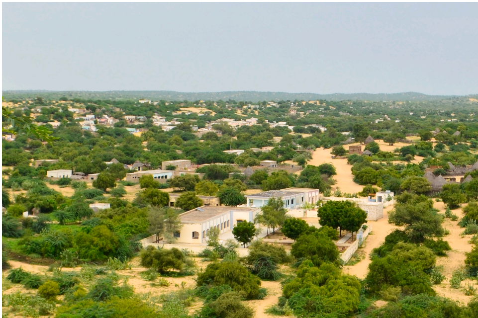
Fig. 1. A view from Helario village in Tharparkar.