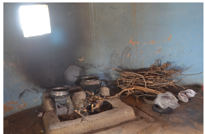
Fig. 9. Mud cookstove showing smoke residue on the wall.