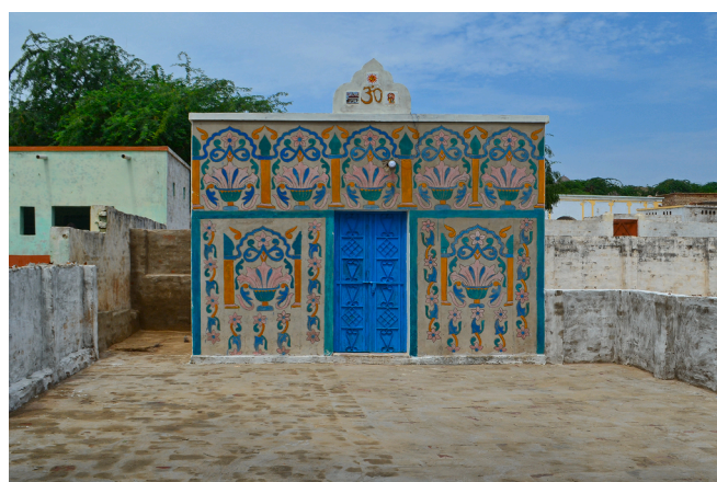
Fig. 5. Village temple.

cookstove, mostly located inside the house (89.3 % of households) without any air extractor or chimney (Figs. 8 and 9). It was therefore unsurprising that respiratory issues were the major health issue