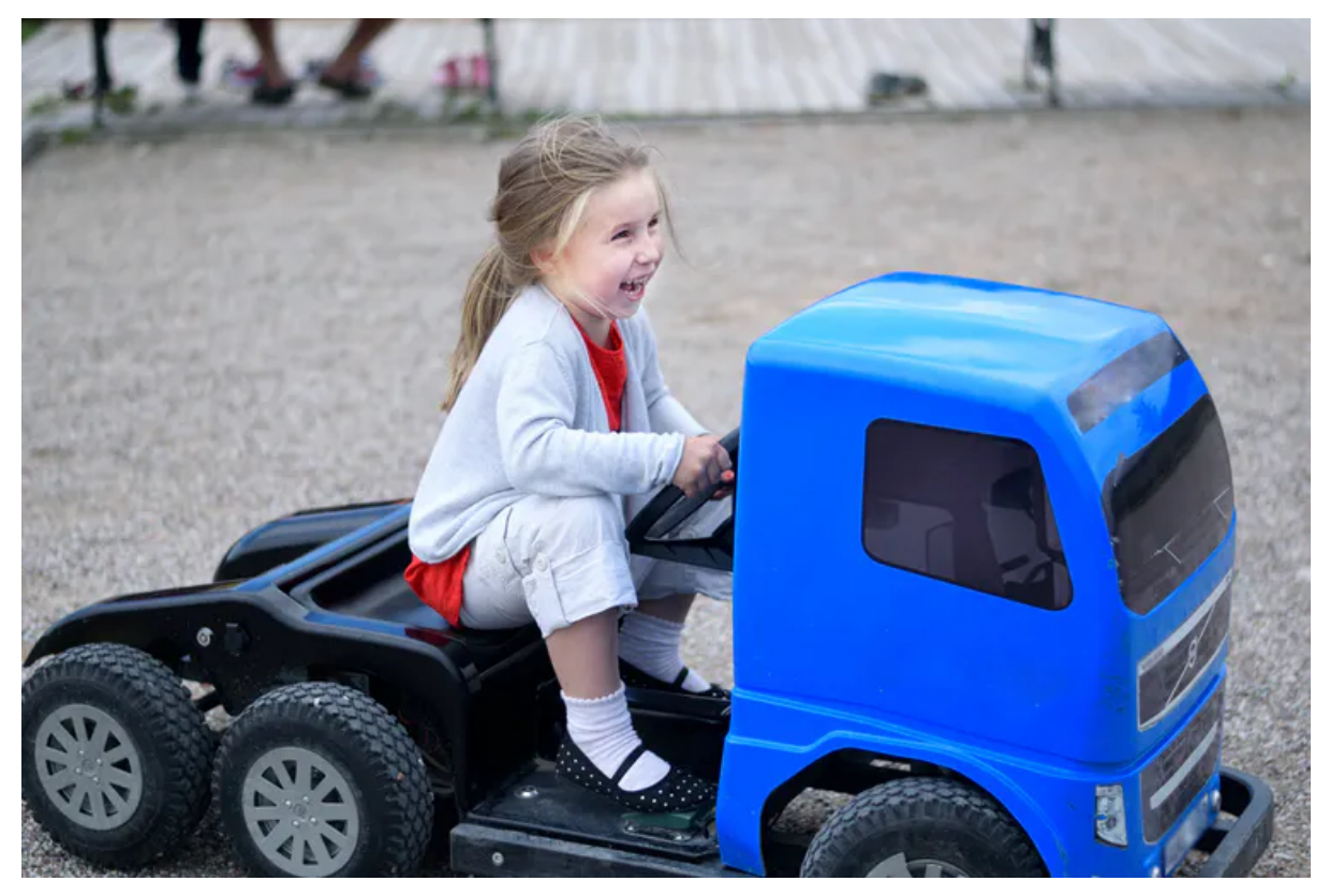
Manufacturers are increasingly talking about play patterns rather than gender.

While girls' and boys' manufacturing divisions continue to exist in larger toy companies, most manufacturers would now prefer to talk about play patterns rather than gender.