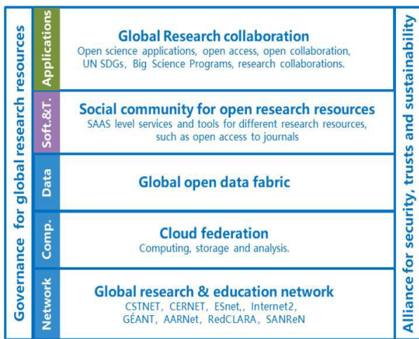
Fig. 1. The Global Open Science Cloud Common Technical Framework 16

We foresee that AI-powered technologies can be used in the implementation of the GOSC common technical framework. For example, AI has the potential to revolutionise various aspects of scientific research, including data analysis, knowledge discovery, and decision-making, and can therefore play a significant role in advancing the goals of the GOSC platform. AI-powered technology can also bring significant benefits to the GOSC federation by improving resource management, service placement, fault detection and recovery, security and compliance, Service Level Agreement (SLA) management, and cost optimization. These capabilities can help the GOSC federation achieve better performance, increased reliability, enhanced security, and improved cost-efficiency, ultimately leading to a better user experience and increased customer satisfaction.