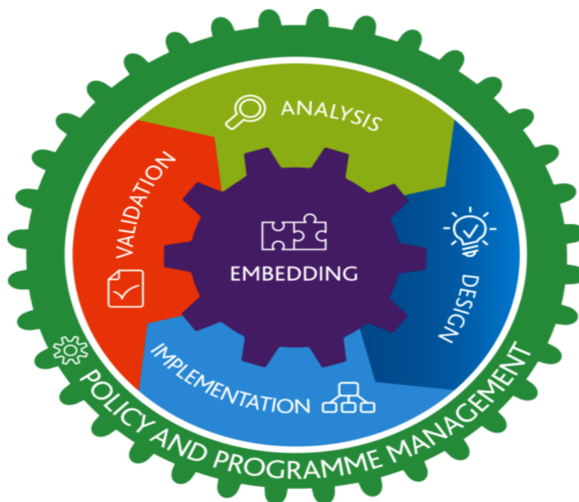
Fig. 1: Business Continuity Lifecycle]

The implementation of Business Continuity Management is paramount for organizations to safeguard their reputation, bolster resilience, and ensure uninterrupted business operations in the face of unforeseen internal or external disruptions. The efficacy of the established Business Continuity Plan necessitates validation, testing, and periodic review through the conduct of drills. However, it is widely acknowledged that the preparation and execution of drills demand considerable efforts and time. Furthermore, manual execution of these drills often proves to be time-consuming, prone to errors, and resource-intensive. In this regard, automation emerges as a viable solution to surmount these challenges, enabling efficient and effective execution of drills.