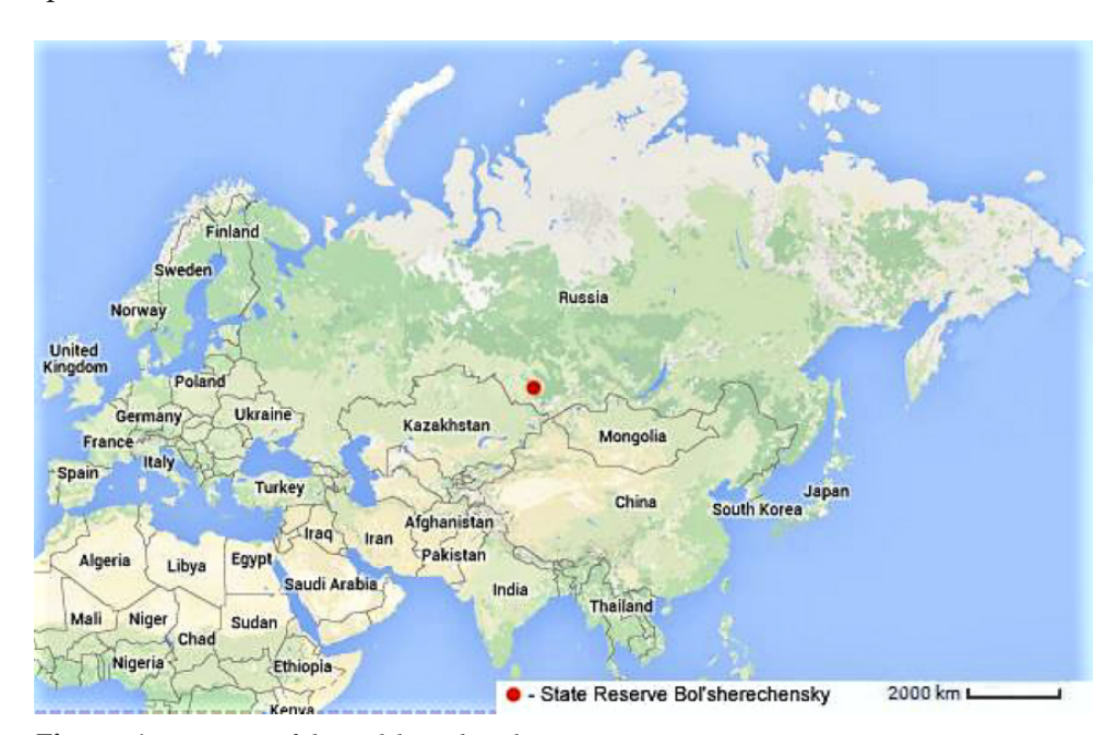
Figure 1. Location of the Bolsherechensky State Nature Reserve.

The increasing development of the Upper Ob forest massif in Altai Krai through forestry, agriculture, and tourism has led to changes in natural complexes and consequent impacts on the avifauna (Poyarintsev et al. 2016; Vazhov et al. 2021; Demidovich et al. 2021). Specially protected natural areas, such as wildlife sanctuaries, are established to conserve pristine areas of nature and therefore necessitate research. Birds play a crucial role in forest ecosystems, as they are highly responsive to environmental changes and can serve as valuable bioindicators of ecosystem health (Vazhov et al. 2021; Kovaleva et al. 2021). However, the avifauna in some specially protected natural areas of Altai Krai, such as the Bolsherechensky State Nature Reserve, has not been adequately studied (Fig. 1). Previous studies have provided limited information, consisting mainly of scattered bird sightings without specific location details or abundance estimates (Chupin, Petrov 2005; Zakaznik 2009; Vazhov 2015). Even the regional Red Data Book lacks sufficient information on rare bird species in the reserve (Red Data Book 2016).