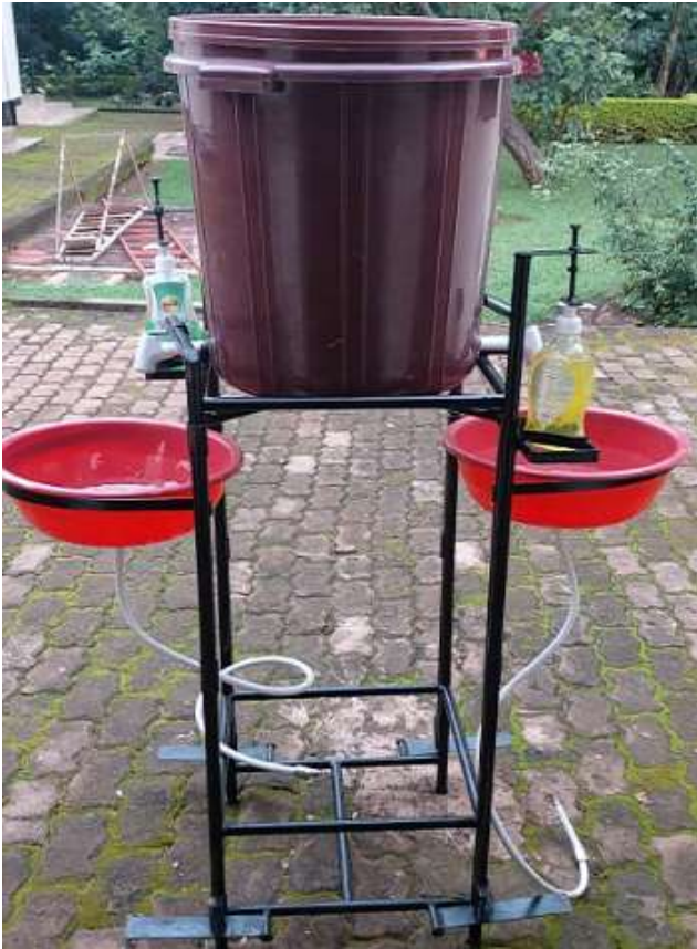
Figure 2: a hand-washing device that uses a foot pump for dispensing both the water and liquid soap donated by IPH-KCMUCo to the central market in Moshi municipality and ward executive office