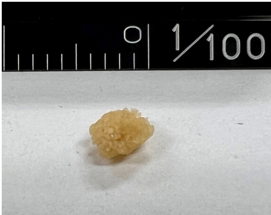
Fig. 2. Eliminated ureteric calculi consists of cystine.

examination demonstrated a body temperature of 37.6 °C and right lower quadrant tenderness with slight guarding and rebound, as well as costovertebral angle tenderness. Blood test results revealed normal white blood cell count of 8.37 \times 10^3/\mu\text{L} (normal range for children of