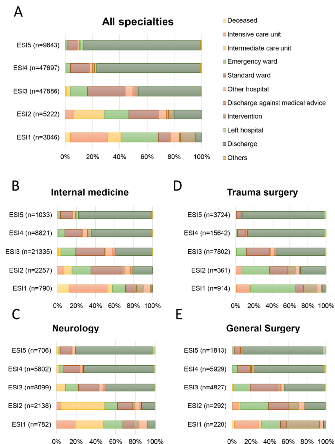
Figure 2 Patient disposition in general and according to the responsible medical speciality. Patient disposition according to Emergency Severity Index (ESI) for all patients (A) and for patients with chief complaints pointing at problems related to internal medicine (B), neurology (C), trauma surgery (D) or general surgery (E).