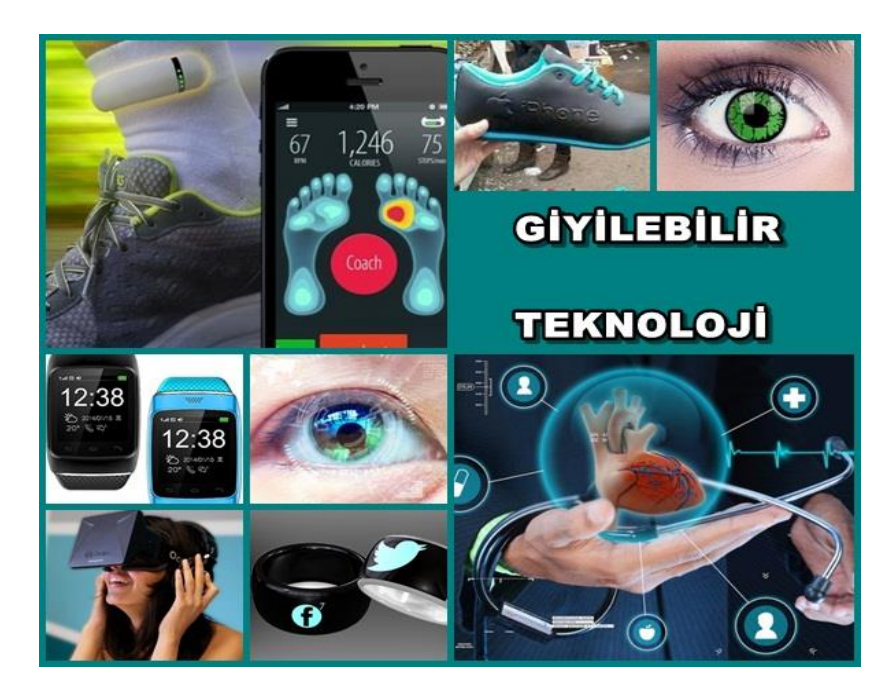
Figure 2. Wearable Technology Samples

Wearable technologies are much more than pedometers. Scientists are pushing the boundaries of this technology with robotic homes for paraplegic patients and very thin, embedded sensors that monitor functions by connecting them to organs.