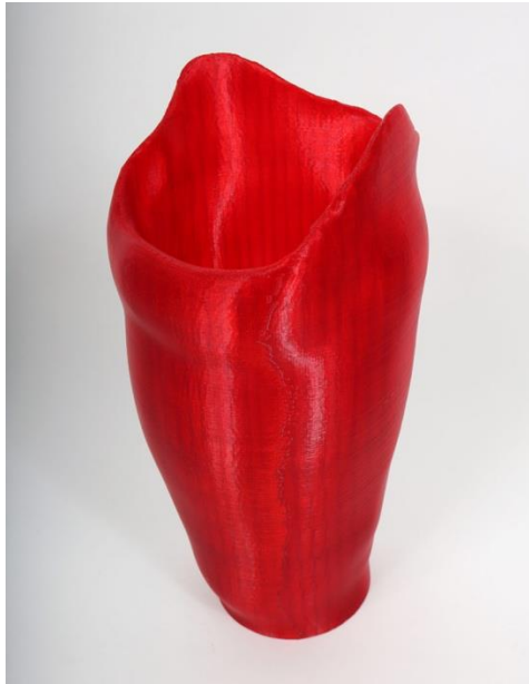
Fig 4. An LLP socket using FDM printing (Nia Technologies)

utility of modelling approaches developed so far (Bikas, Stavropoulos, and Chryssolouris n.d.).