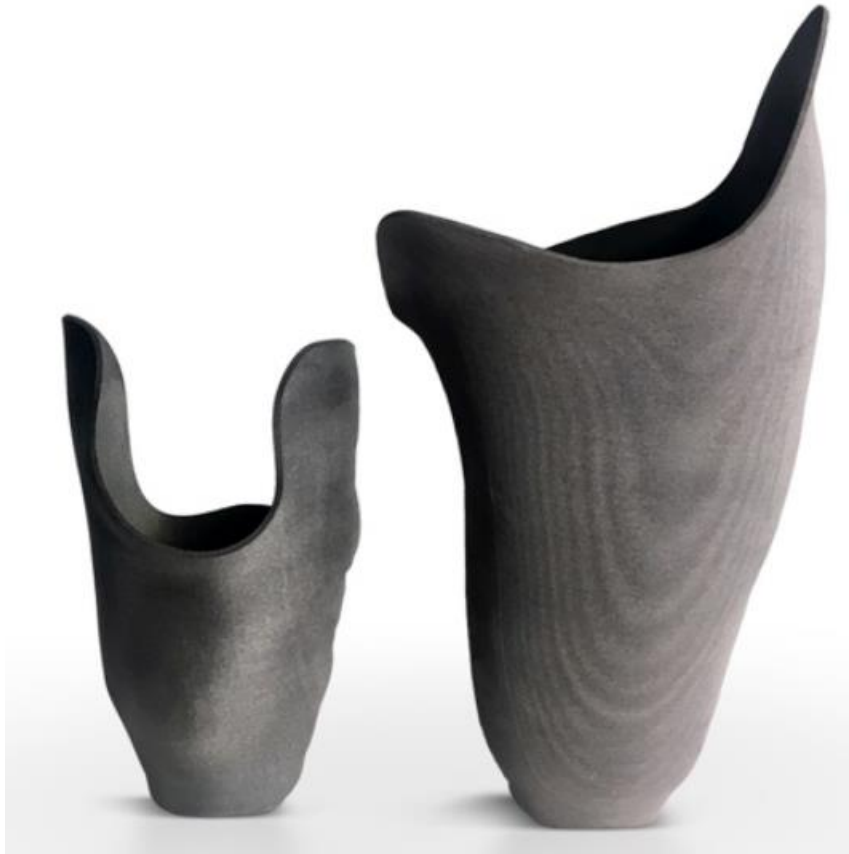
Fig 5. The Optimal Socket from Prosfitt using Multi Jet Fusion ( www.prosfitt.com )

Prosfitt, a company based in Sofia (Bulgaria) founded in 2013 by Alan and Chris Hutchinson with the specific aim of developing a digital scanning and 3D printing solution for prosthetic sockets. They began printing using FDM and launched their Original below knee socket, which was rated to 100kg, in 2016. In 2018, they launched the Optimal version available for above knee and below knee, which is printed using a HP service bureau using Multi Jet Fusion in HP High Reusability PA12- and is rated to 125kg, these can be seen in Figure 5. Prosfitt state that the finished socket is significantly lighter than a traditional socket. They have also developed PandoFit, a full proprietary software platform based in the cloud, with a range of subscription plans.