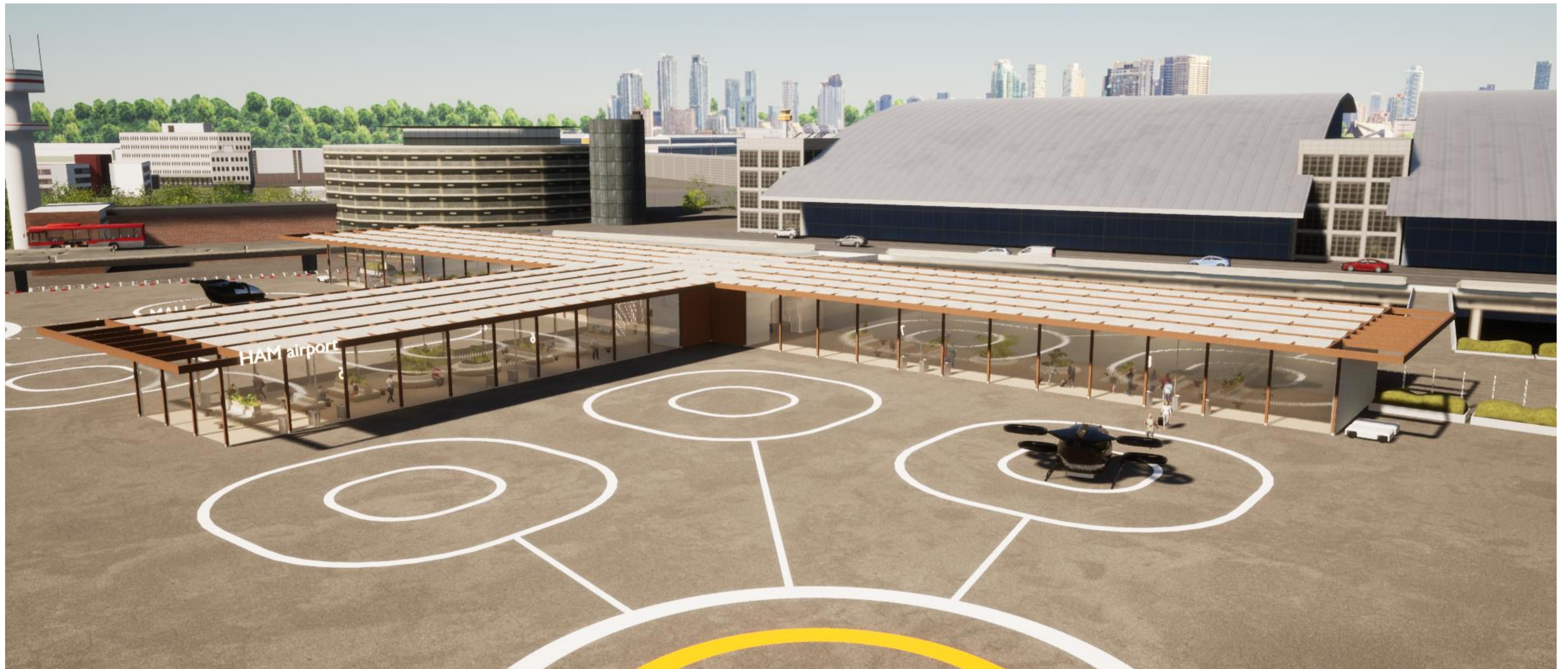
Artistic impression of a vertidrome layout for Hamburg airport.

German Aerospace Center (DLR), Institute of Flight Guidance *bianca.schuchardt@dlr.de