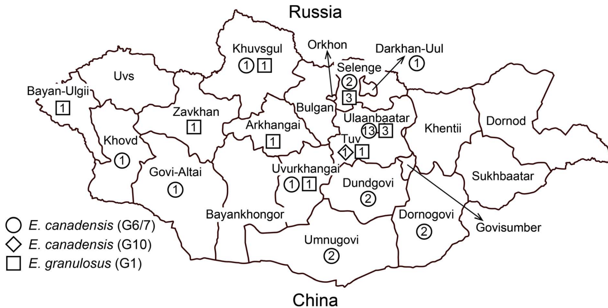
Figure 2. A map of Mongolia showing the distribution of 39 CE cases caused by E. canadensis (G6/7) (n = 26), E. canadensis (G10) (n = 1), and E. granulosus s.s. (G1) (n = 12). Additional four cases had no record of province (see Table 1). doi:10.1371/journal.pntd.0002937.g002

AB893264. Phylogenetic analysis clearly showed that 12 specimens (10 haplotype) were E. granulosus s.s. (G1) and 29 (12 haplotypes) and 2 (1 haplotype) specimens were E. canadensis (G6/7) and (G10), respectively (Table 1, Figure 1). For three specimens (Nos. 19, 27, 45), only a partial sequence (828 bp) was determined. BLAST search revealed that the sequence was 100% identical to the cox1 gene sequence of E. canadensis (G6/7) (Accession Number = AB813182). Among 43 specimens, 39 [11 E. granulosus s.s. (G1), 27 E. canadensis (G6/7), one E. canadensis (G10)] had data available on patient age, sex and province of residence (Table 1, Figure 2). CE cases were found from 14 provinces, including UB (Figure 2). As shown in Table 1, all pediatric CE cases (n = 18) were caused by E. canadensis (100%). Of the 16 CE cases from UB (16/39, 41.0%), 13 cases were caused by E. canadensis (G6/7) (13/16, 81.3%). Among these 13 cases caused by E. canadensis (G6/7), nine were children (9/13, 69.2%).