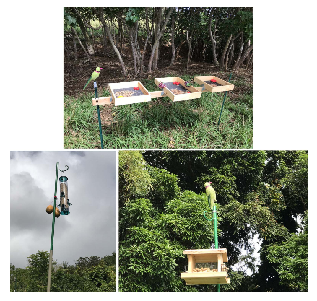
FIGURE 2. Feeders tested on Kaua'i. Platform feeders with decoy parakeet and fruits in cattle pasture, Kaua'i, Hawai'i, USA, February 2020 (top). Tube feeder with decoy fruits and commercial bird seed mix in tropical fruit farm (bottom left), and house-style hopper feeder with decoy parakeet and whole peanuts in tropical fruit farm, Kaua'i, Hawai'i, USA, October 2020 (bottom right).

A tube feeder (Stokes Select Jumbo Seed Songbird Tube Feeder, Classic Brands, Denver, CO, USA) was baited with the same commercial bird seed used in the platform feeder trial. A hopper feeder (Large Ranch Wild Bird 5lb Cedar Combo Seed & Suet Bird Feeder, National Audubon Society, Manhattan, NY, USA) was baited with whole peanuts. Both feeders were elevated to a height of ~3.3 m using metal electrical conduit. We painted the conduit brown and green to better replicate vegetation and