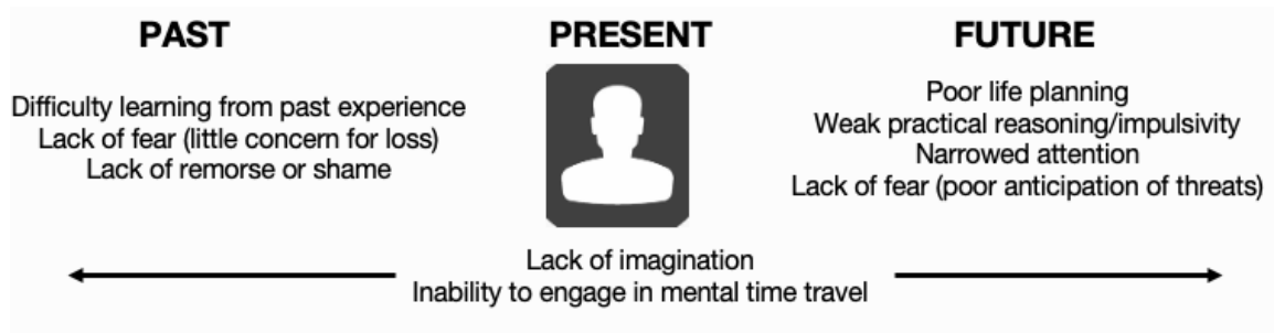
FIGURE 2. Psychopaths' Indifference to Counterfactual Selves