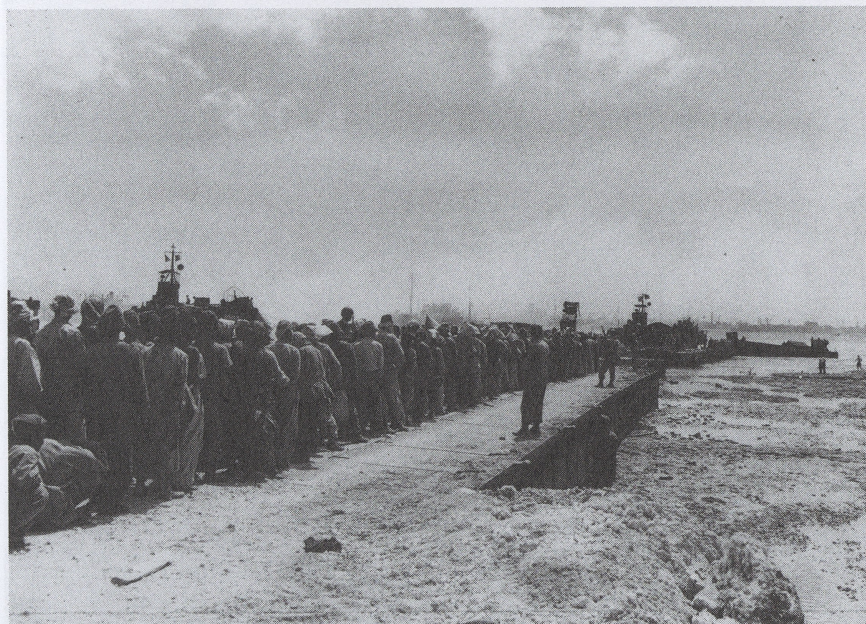
POWs at docks awaiting transport.