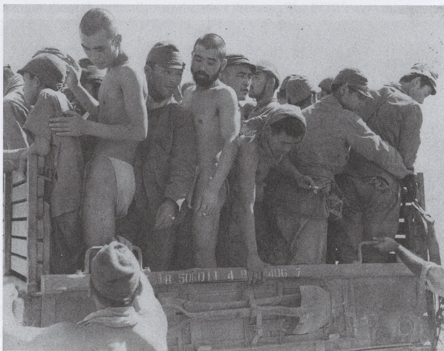
JPOWs trucks.