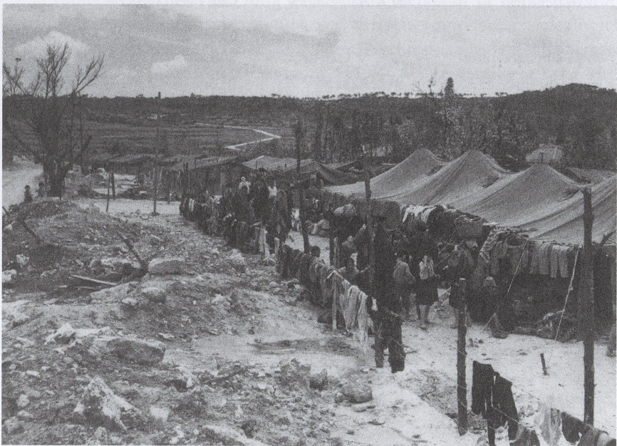
Ishikawa Refugee Camp.