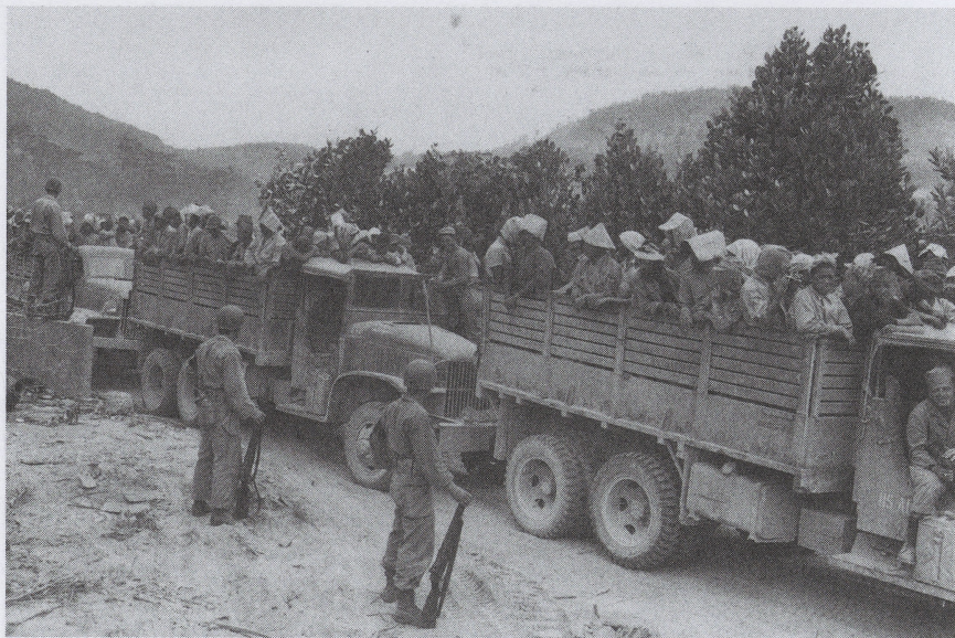
Trucks POWs for Hawaii.