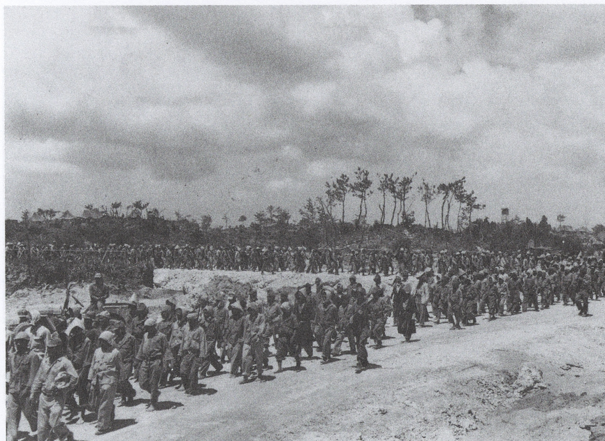
Marching POWs down.