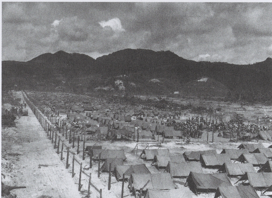
Yaka POW Camp.